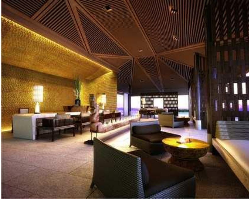
The reception area features designer-selected materials including locally quarried stone, fine timber from Thailand and exotic Thai silks.