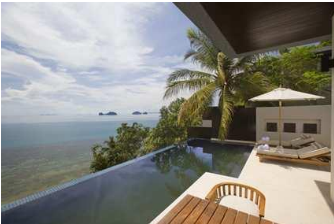
Each villa features a private, 10-meter infinity pool and a sundeck.