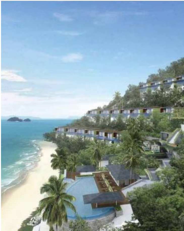
Villas are all ocean-facing to enjoy the panoramic views of the ocean.