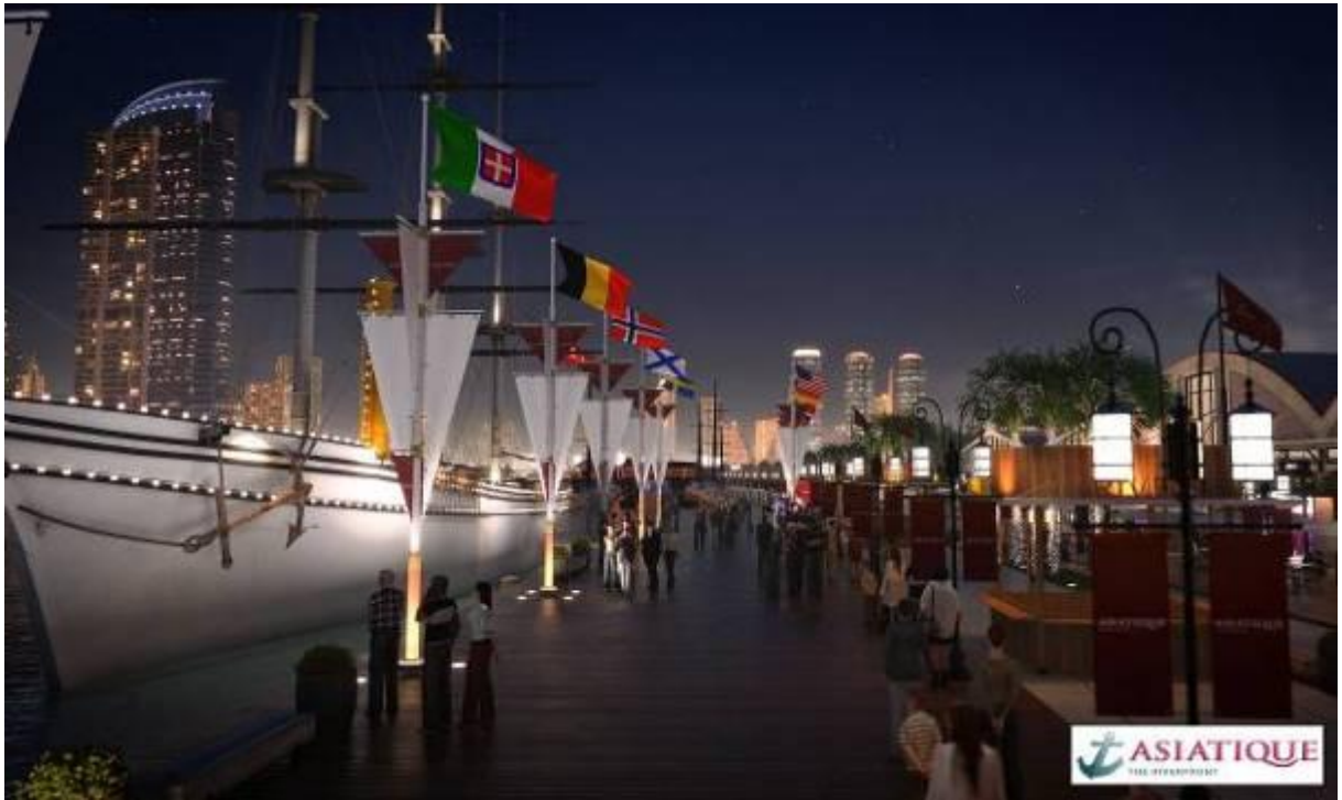
The venue will have the longest public boardwalk in Thailand.