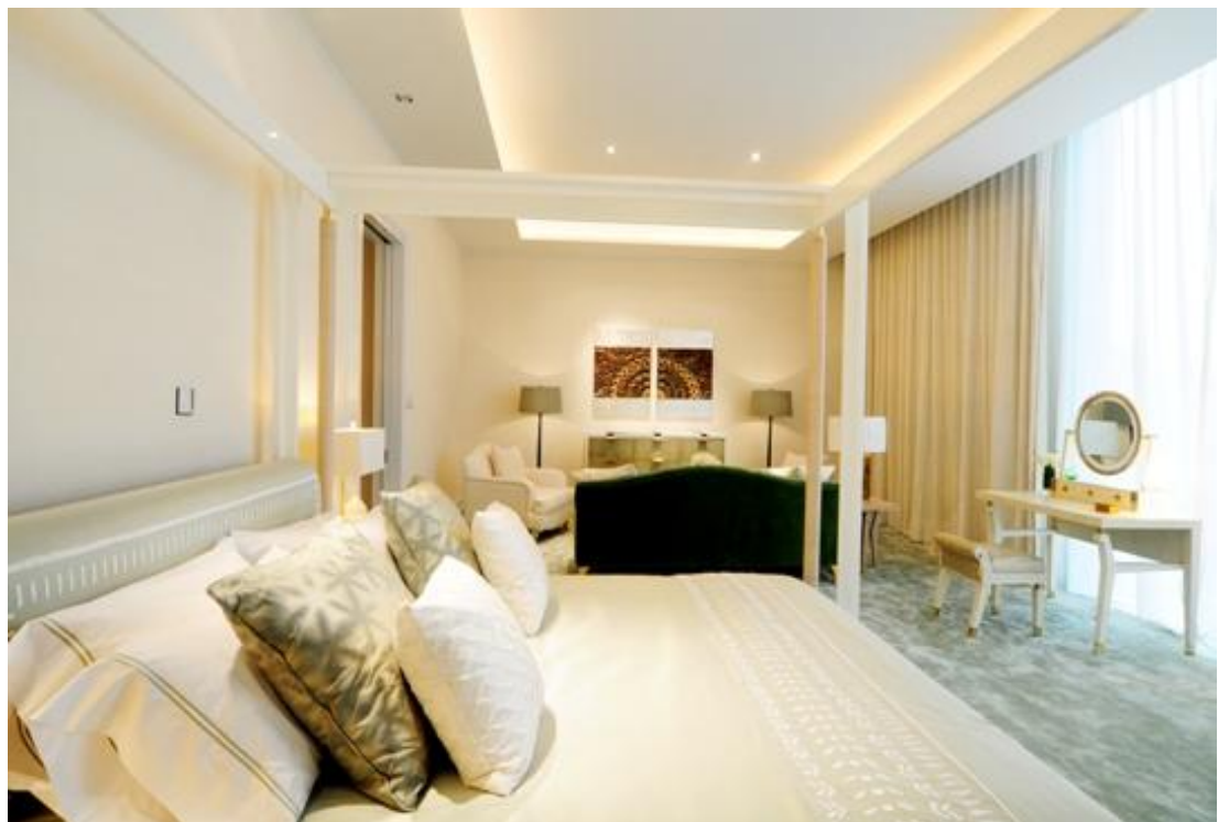
Master bedroom. The cabinet against the wall hides a television set which can be remotely operated to slide upwards out of the cabinet.