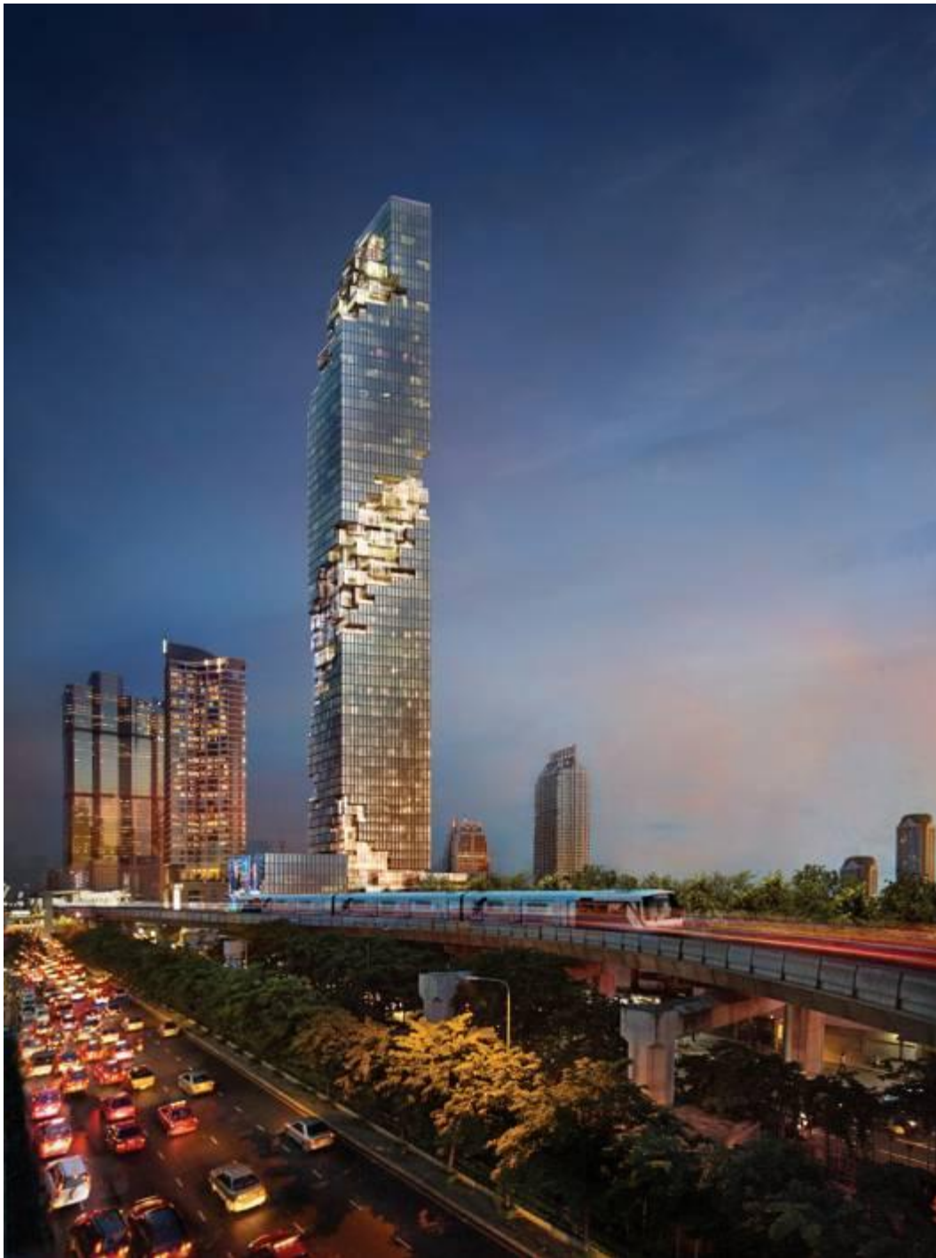
Night view of the spectacular MahaNakhon building.