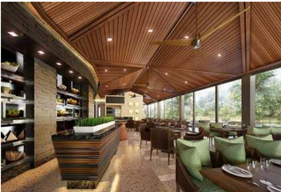
The fine dining restaurant provides a selection of exotic Asian and international dishes.