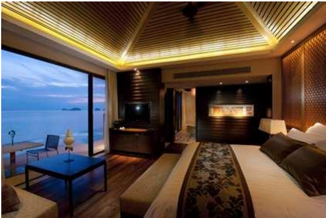
The interior of the Oceanview Pool villas has been designed using locally quarried stone, fine timber of Thailand and exotic Thai silks.