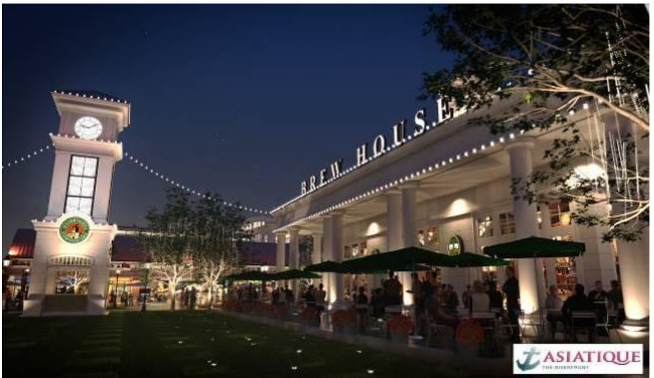
Town Square District.