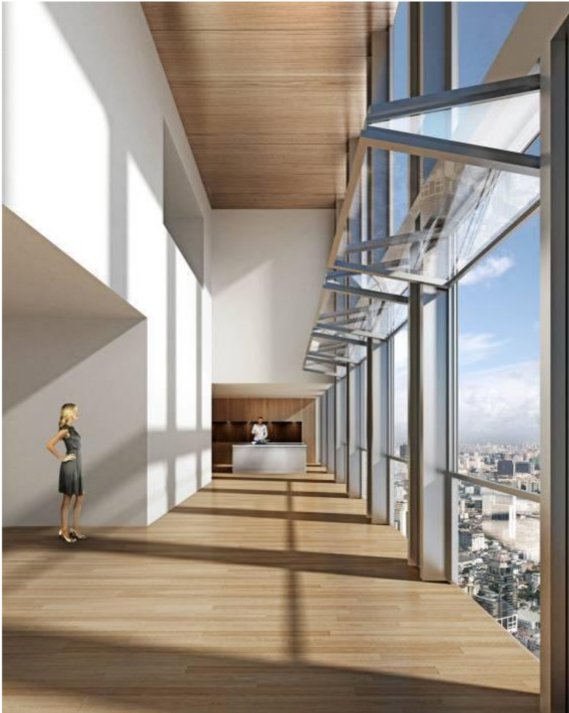
The residences will have ceilings up to 3.5 meters high and floor-to-ceiling glass windows to provide expansive panoramic views.