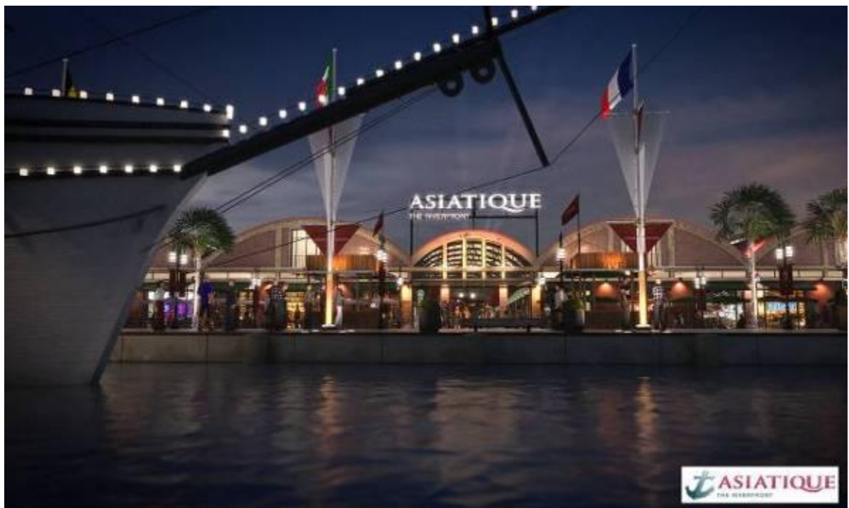
The Waterfront District will offer visitors panoramic views of the Chao Praya River.