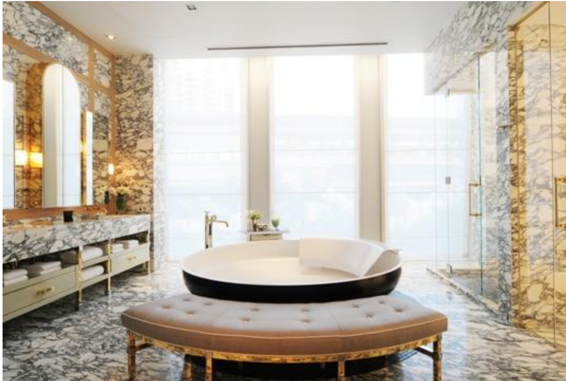
Centerpiece of the bathroom is an enormous circular bathtub.