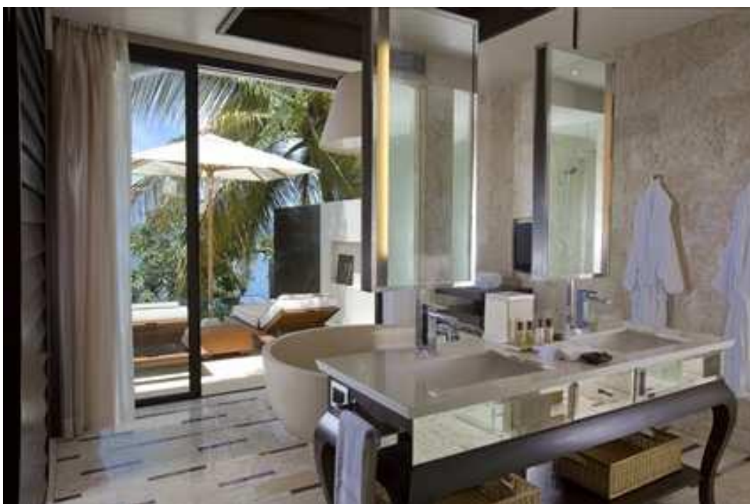
Bathrooms feature an oversized soak tub and multi-nozzle rain shower.