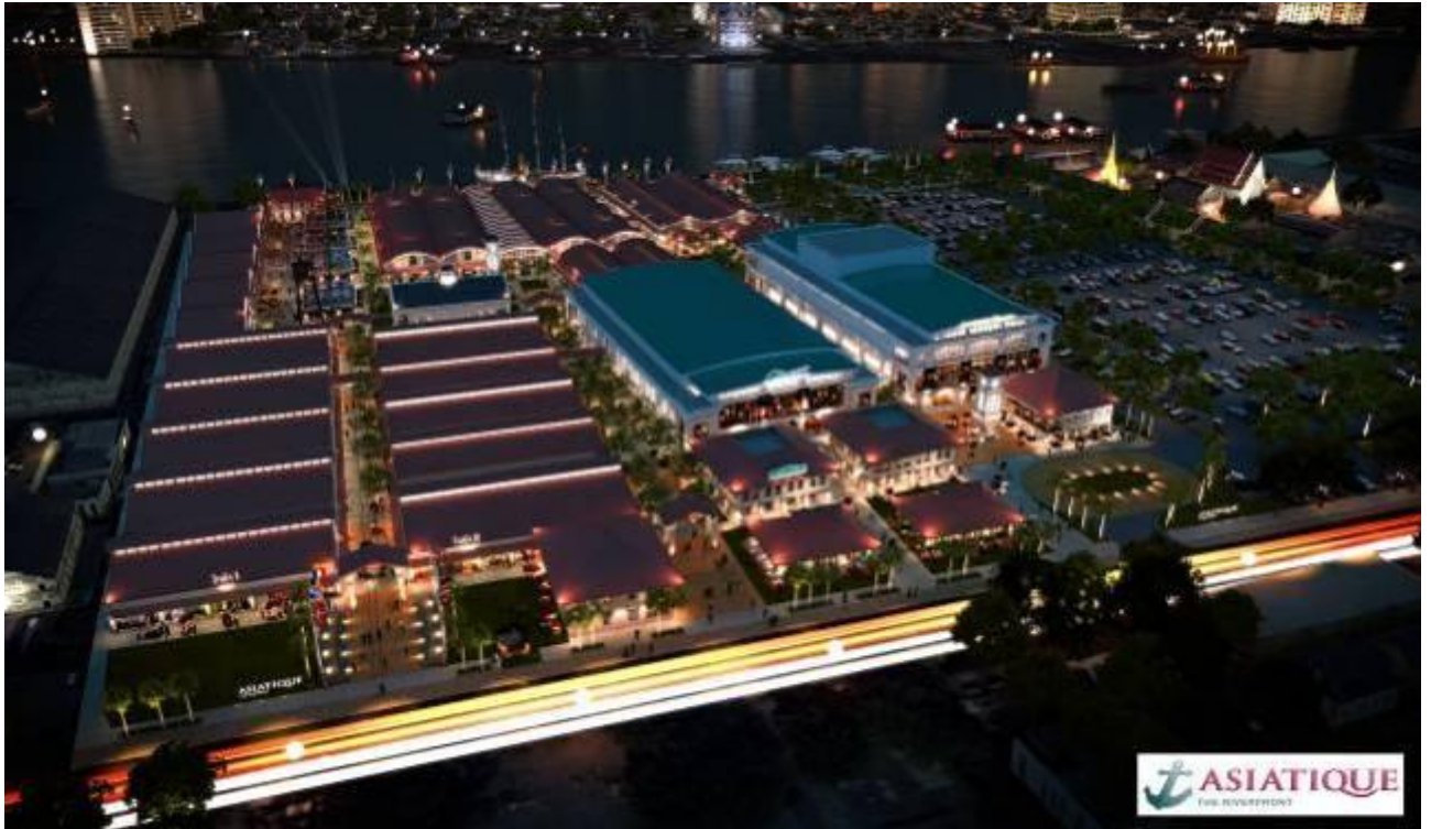
An old, historic port will be renovated to house the new shopping and entertainment venue.