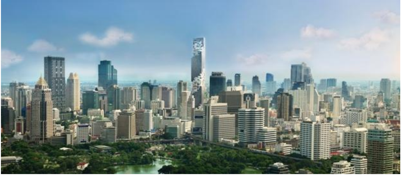
The pixelation gives MahaNakhon an arresting profile on the skyline.