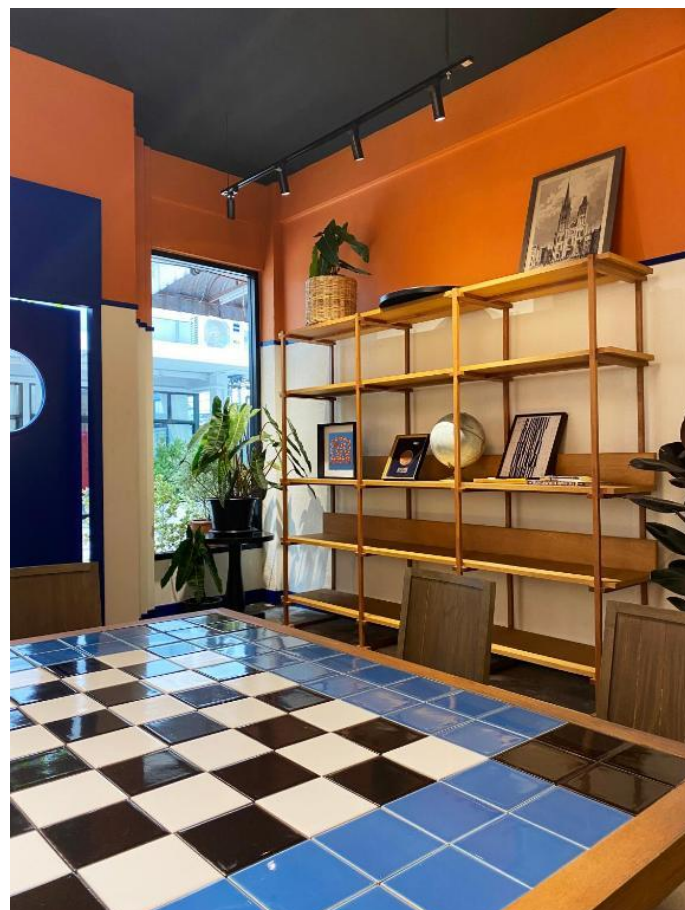
The concept was developed by a husband-and-wife team inspired by childhood memories of boat travel along the Chao Phraya River.