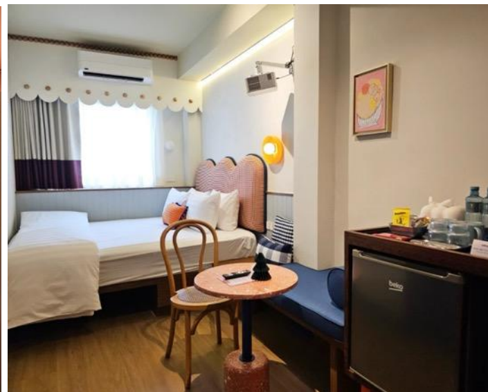
Rooms are compact and functional, designed for short stays, with a quiet and minimal layout.