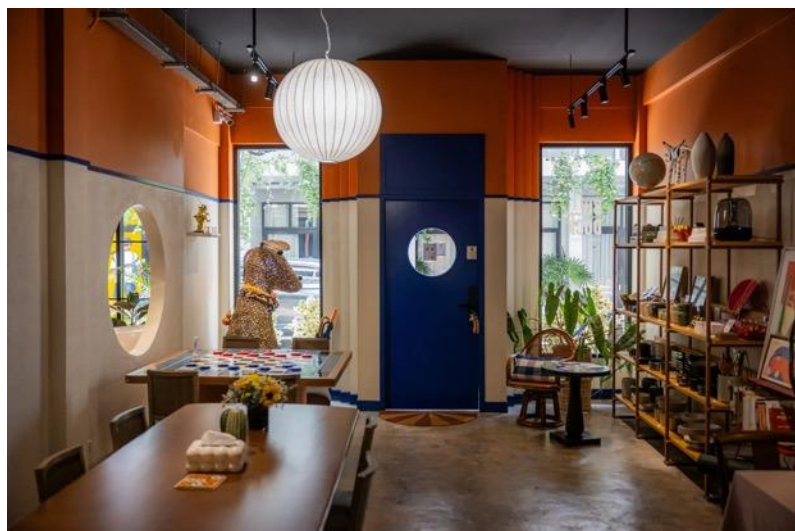
The interior includes maritime-inspired details such as blue tones and references to river transport, combined with traditional Chinese wooden doors, ceramic objects and warm material finishes.