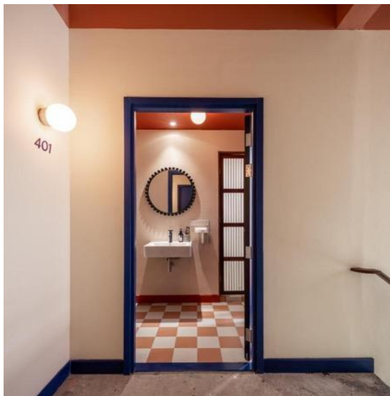
The interior includes maritime-inspired details such as blue color accents and porthole-inspired elements.