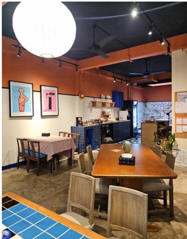
The hotel is set within an existing urban building in one of Bangkok's oldest riverside districts.