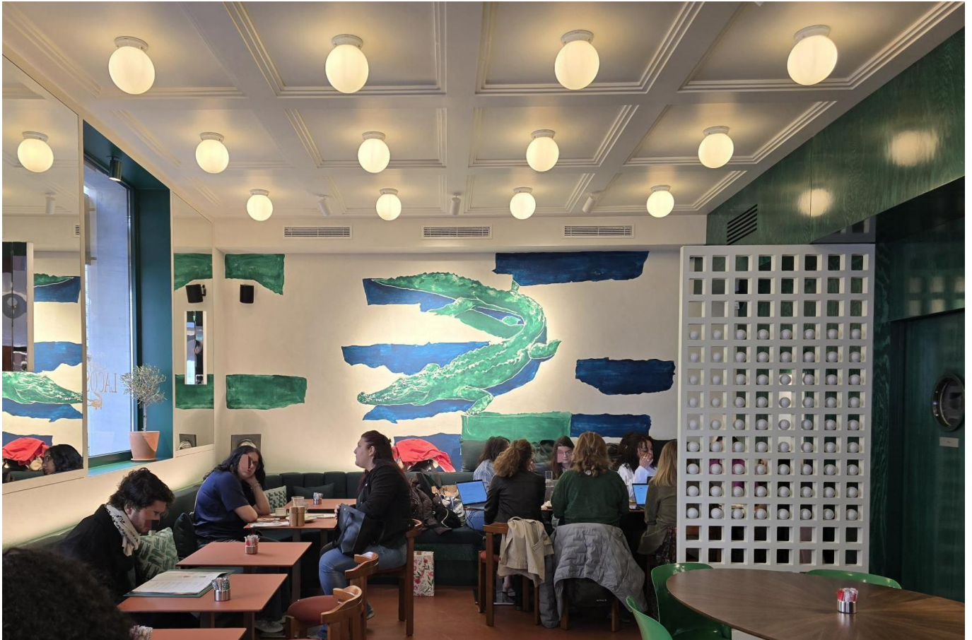
Store Interior 4