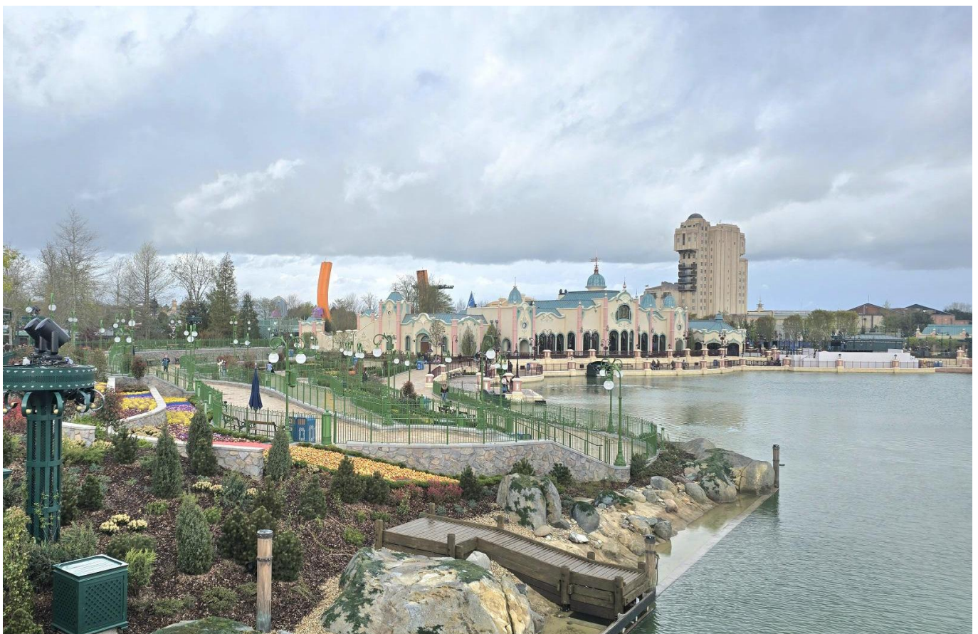
New Area Landscape 4