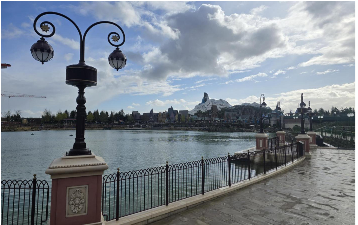
New Area Landscape 1