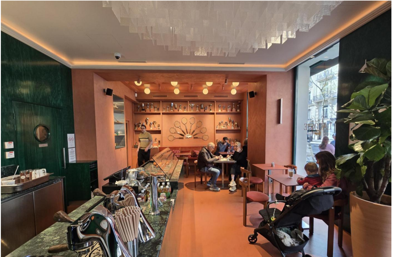
Store Interior 2