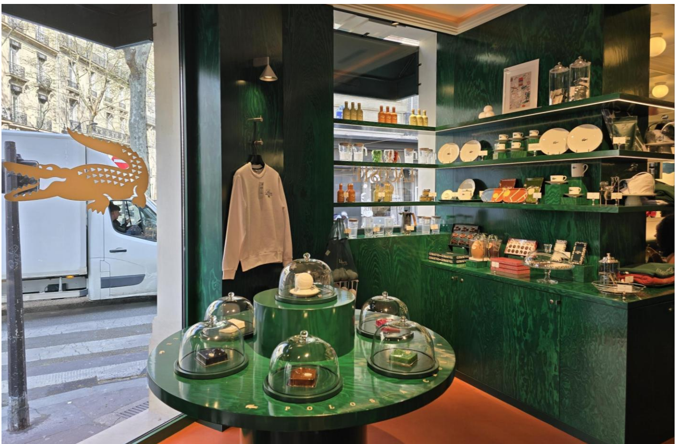
Store Interior 1