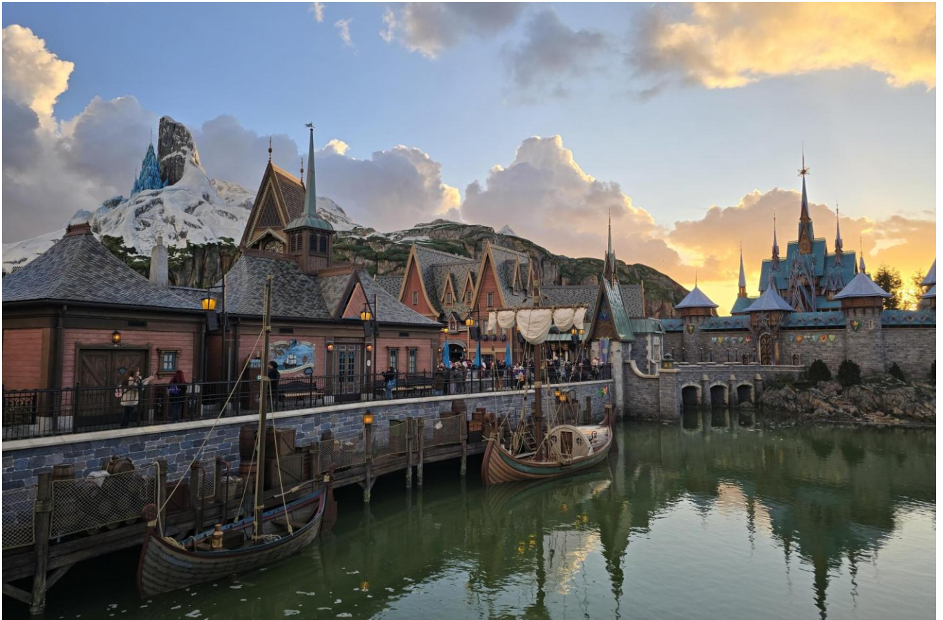
New Area Landscape 3