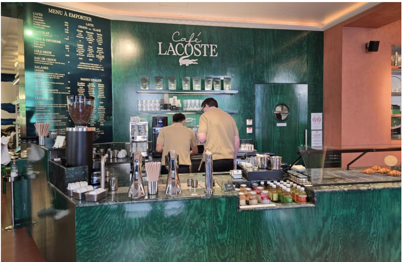
Store Interior 3