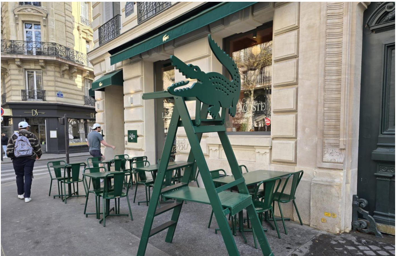
Store Interior 5