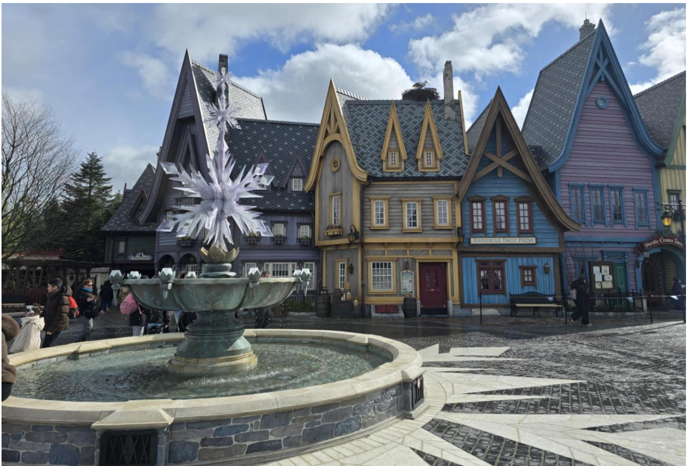
New Area Landscape 2