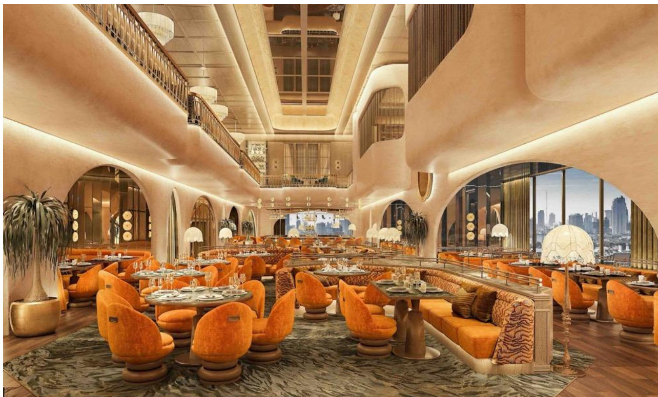
A large dining hall forms the center of the club, oriented toward panoramic city views.