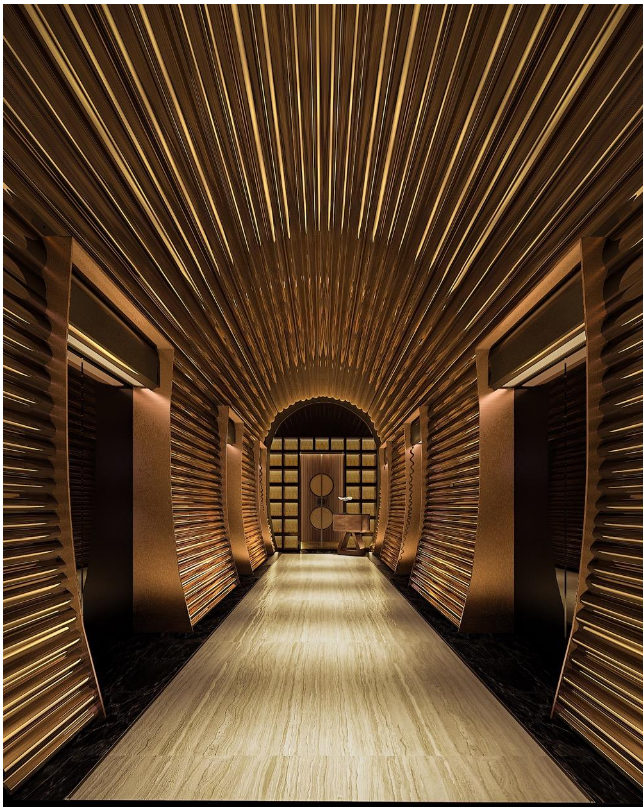
Entrance to the club. Team Wang Design developed the overall spatial concept for the club, including the restaurant, bar areas, and members-only spaces such as private dining rooms and lounges.