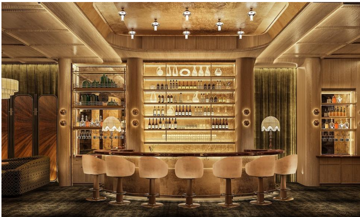
Bar Won, the crowning glory of the club, occupies the mezzanine level above the dining room and is reached via a grand staircase. Its name is multi-layered, hinting at "one," "origin," and the circle of harmony.