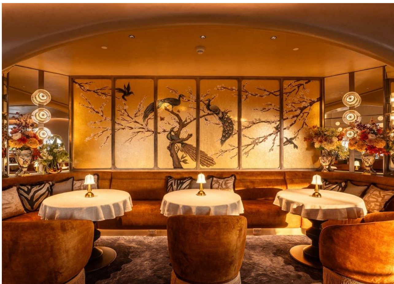
The interior reflects the restaurant's focus on modern Chinese cuisine.