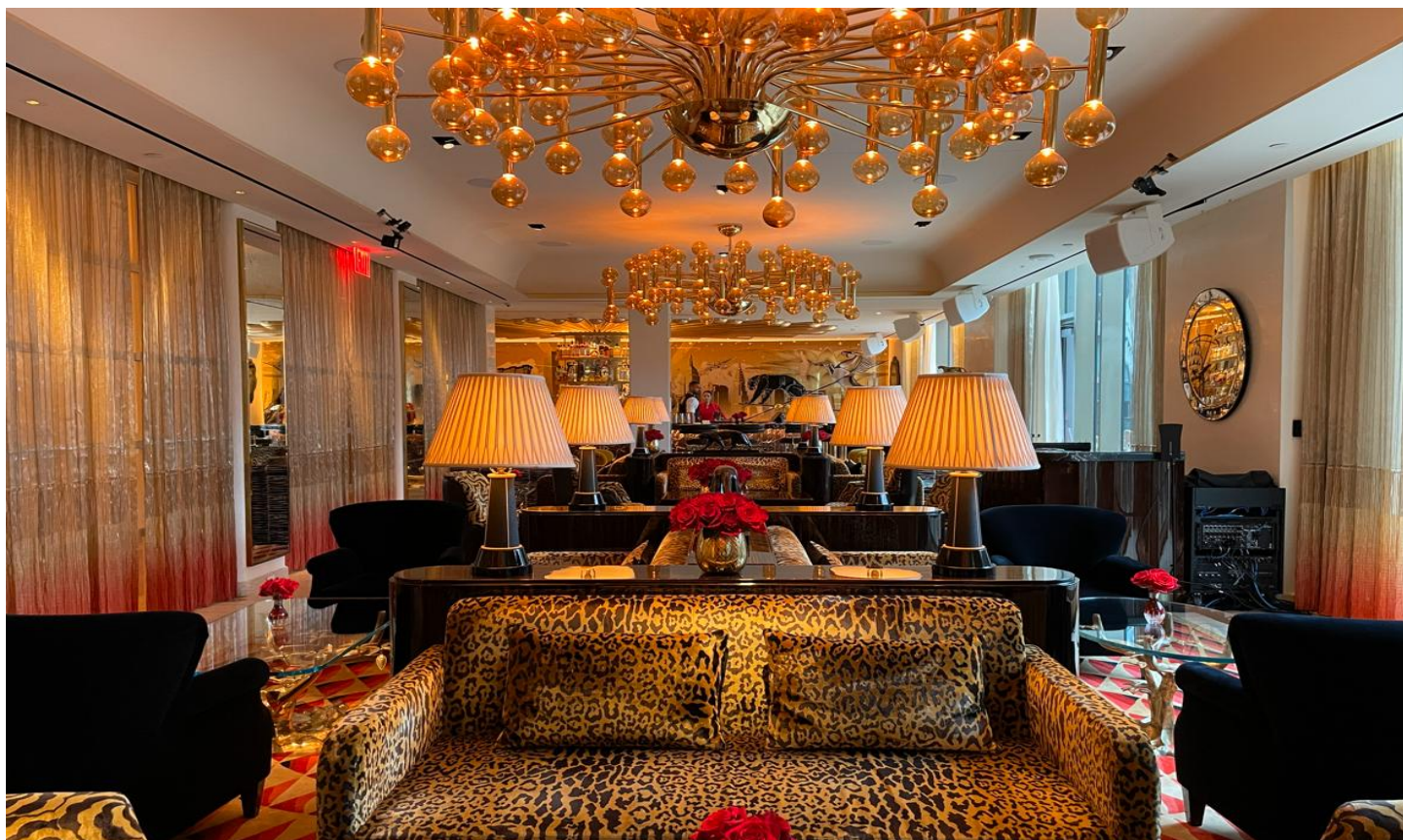
The design varies across each area—the lobby, first-floor restaurant, and second-floor bar.