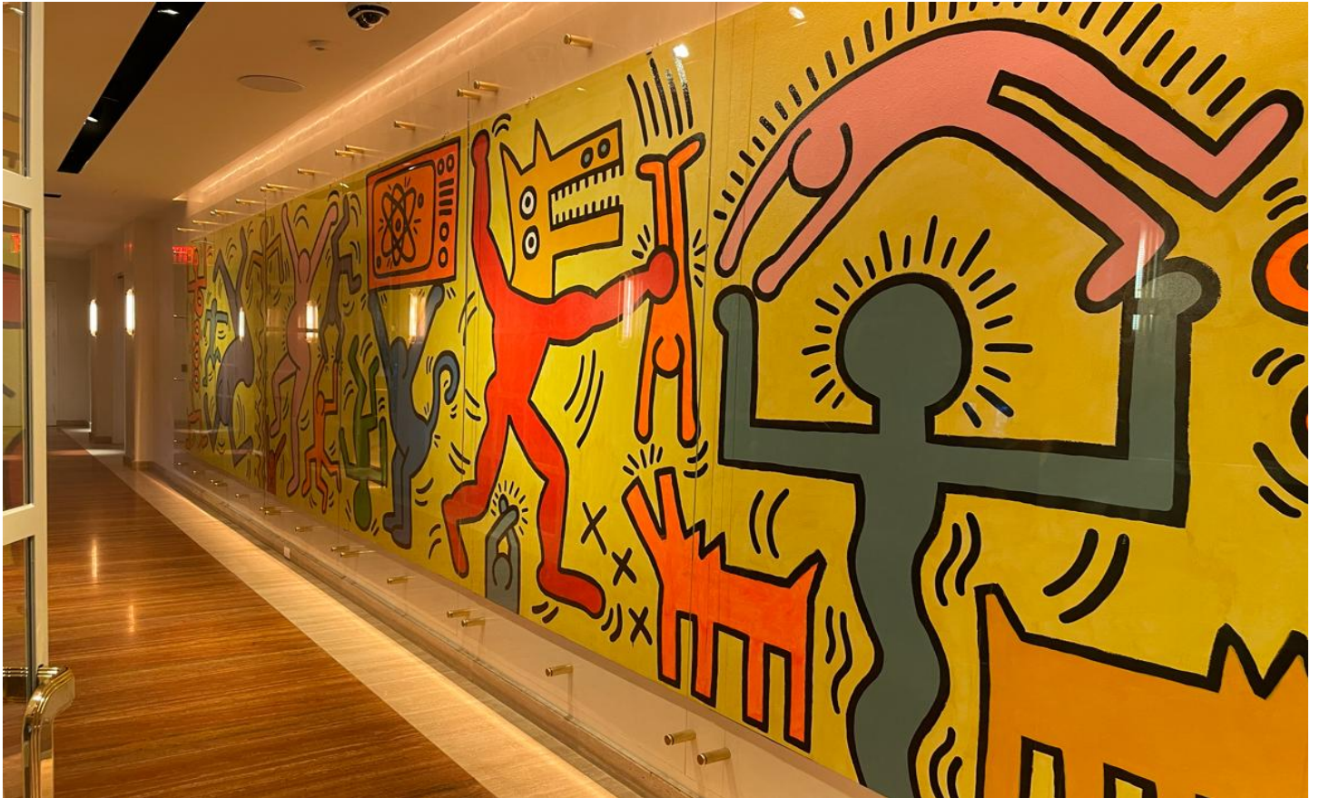
Works by Keith Haring and other artists are prominently displayed.