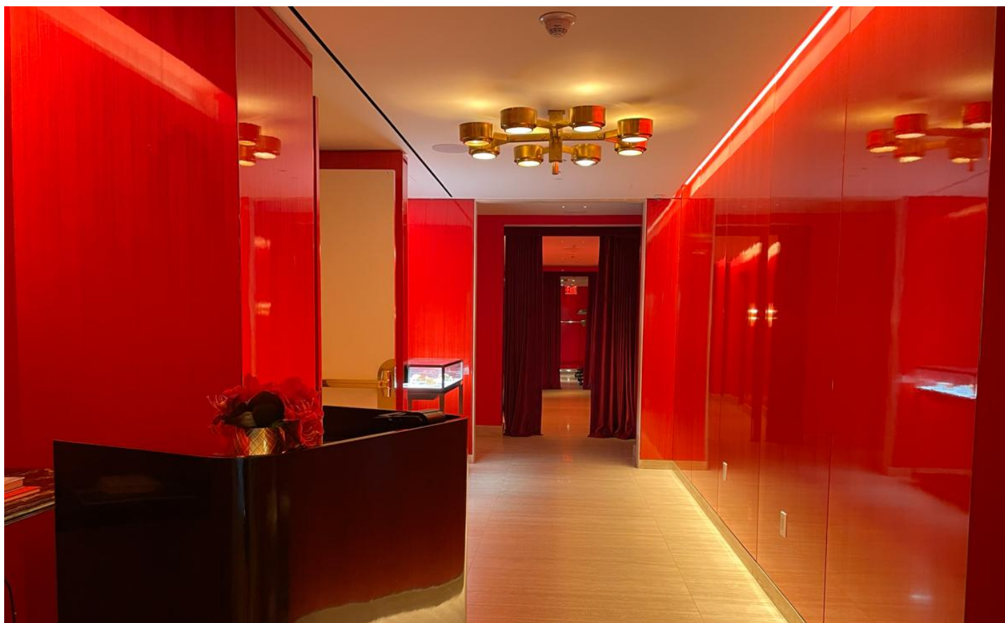
A dramatic red lobby