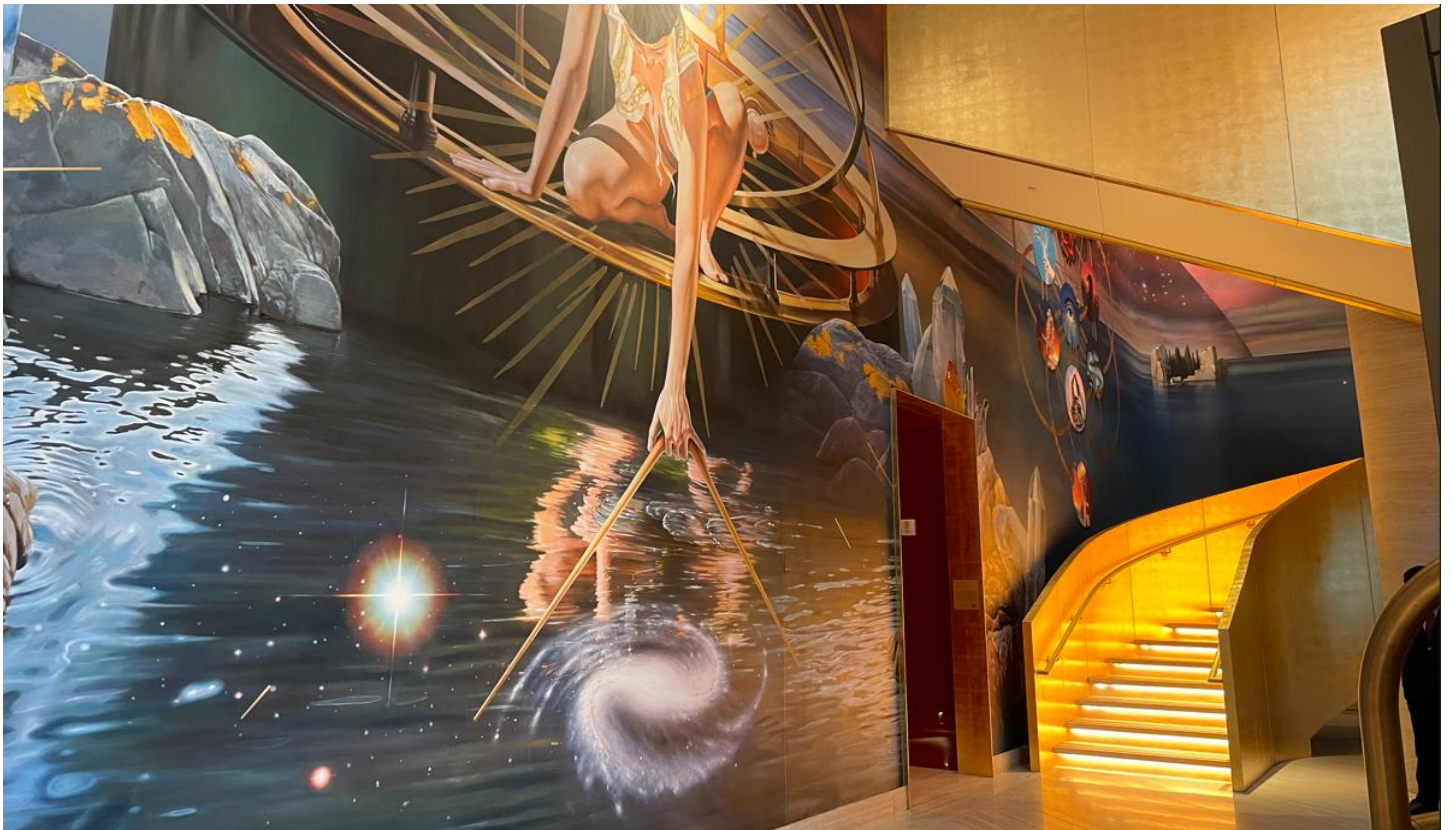
A large-scale mural by an Argentine artist