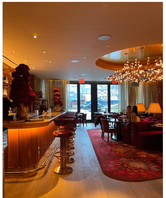
A bar area that is also popular with non-guests