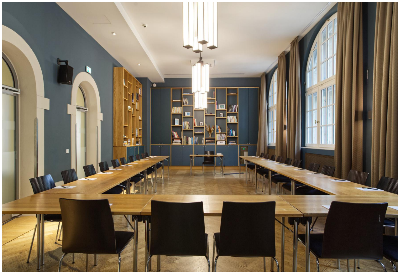
Above: Seminar room located on the lounge bar floor. Below: Meeting room converted from a former shower room, retaining the original doors, benches, and fixtures.