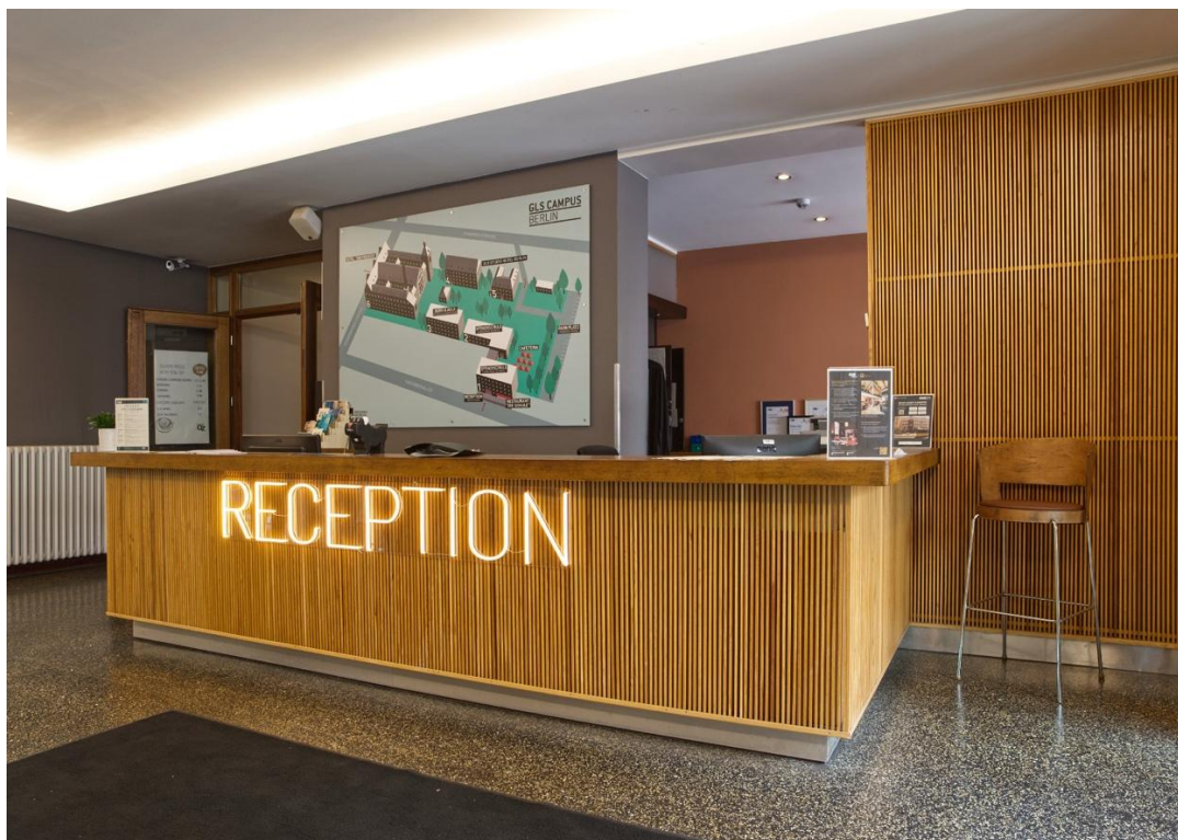
Above: Reception area of the on-campus language school. Below left: 1960s-style mosaic tiles paired with casual DIY wooden furniture.