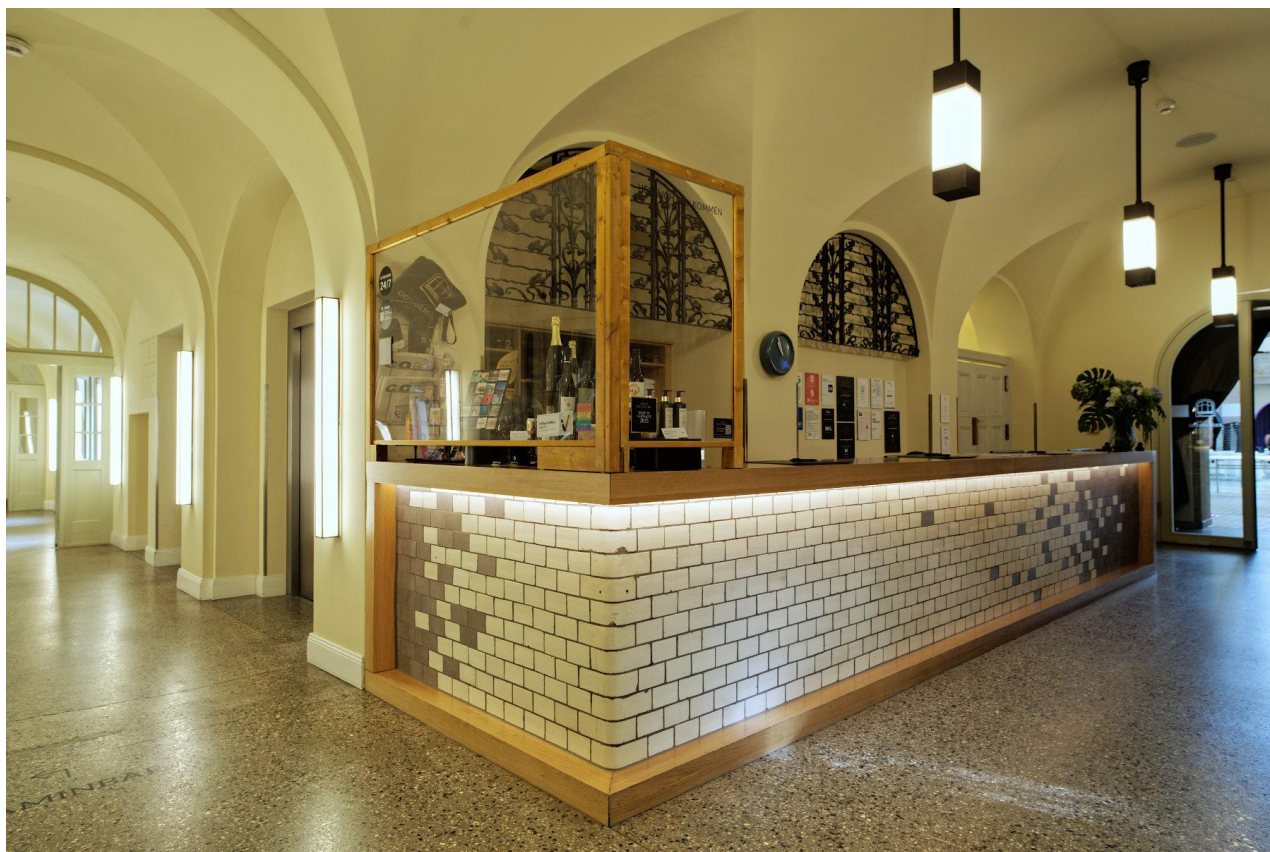
Above: Reception with pool-style tiles. Below: Lounge bar with leather tufted sofas and Art Deco lamps, complementing the fireplace.