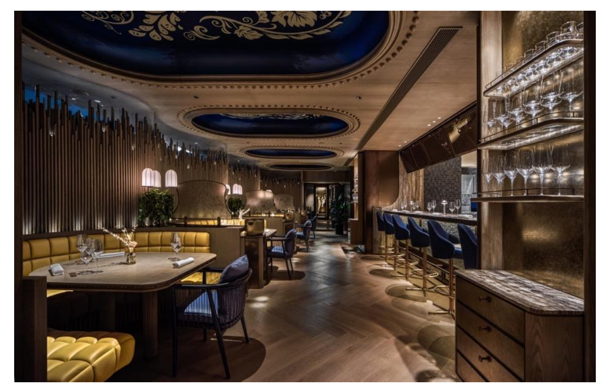
Italian Silhouette is the main dining room inspired by traditional Italian motifs and featuring rich materials and color palette of deep blues, bronze, dark timbers, leather, rippled glass and silver travertine.