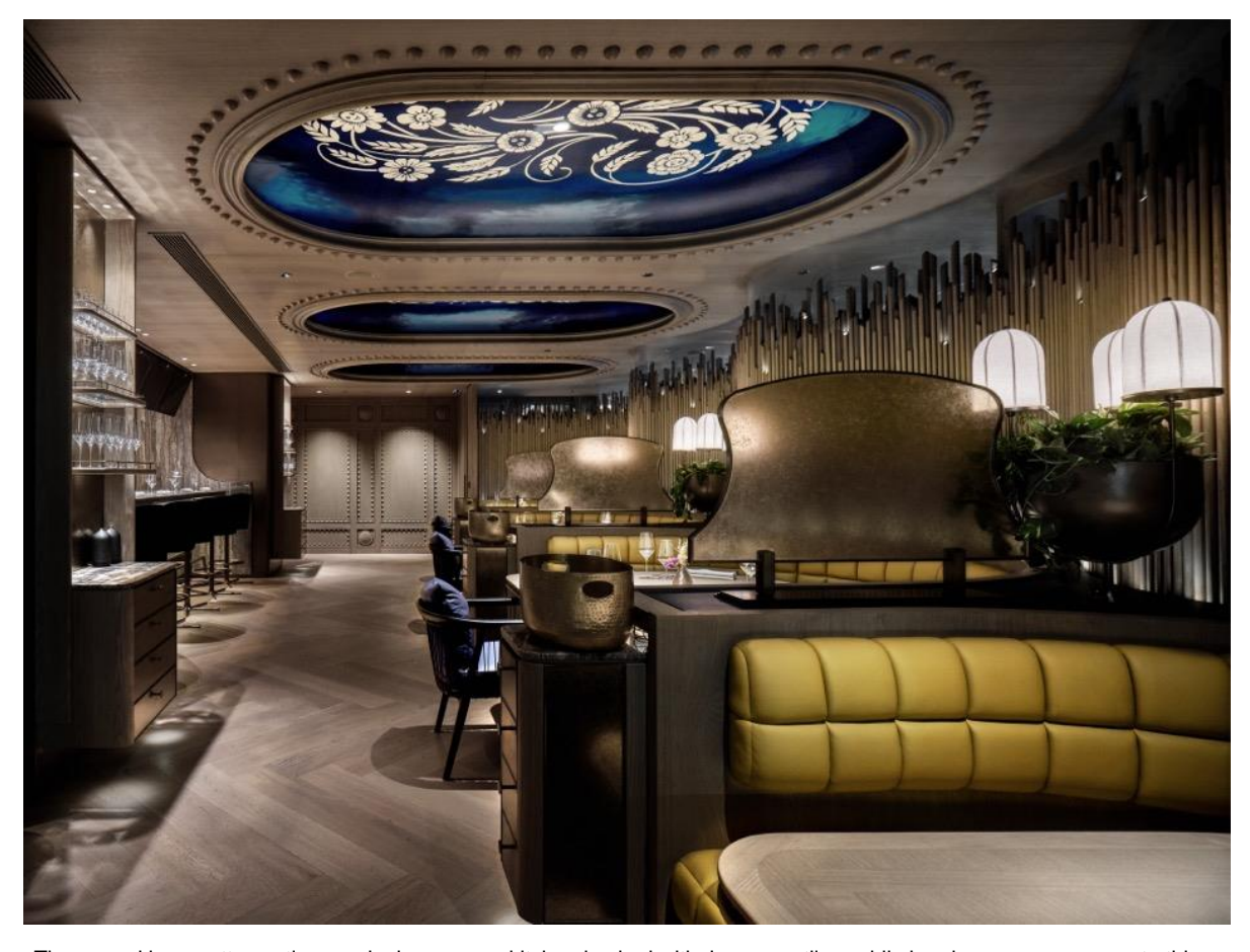
The curved banquette seating overlooks an open kitchen backed with Japanese tiles, while bamboo screens separate this space from the Doodle Garden beyond.