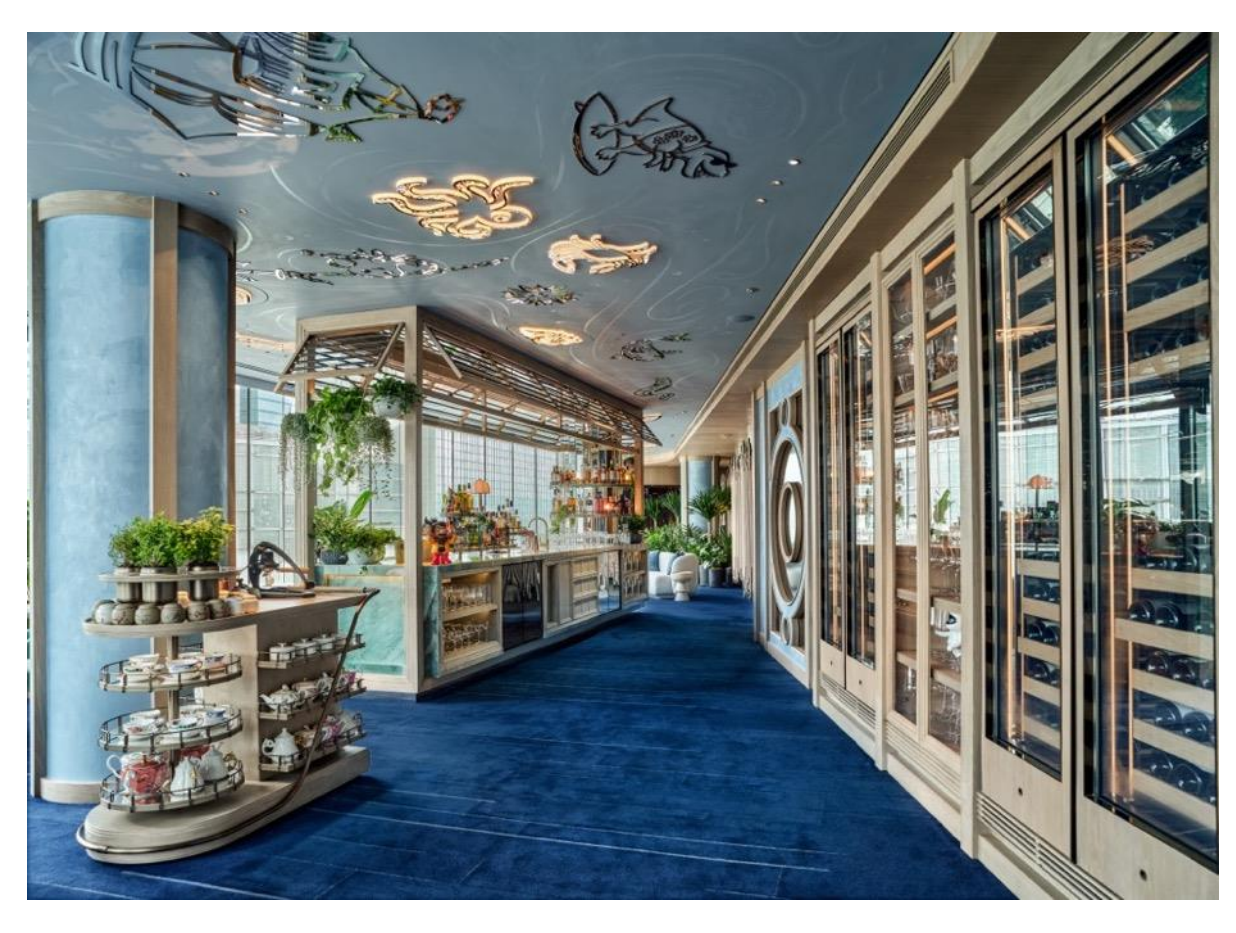
Doodle Garden is a more casual breakout lounge featuring a wine bar kiosk.