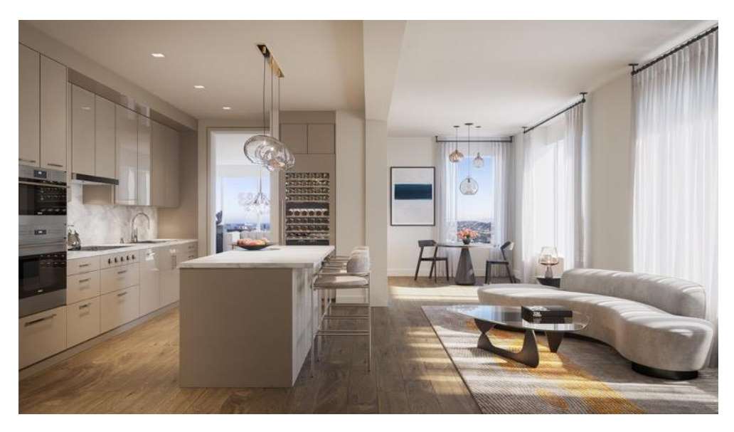
Custom-designed hand-tufted wool rugs and natural wood floors give the interior a stylish look.