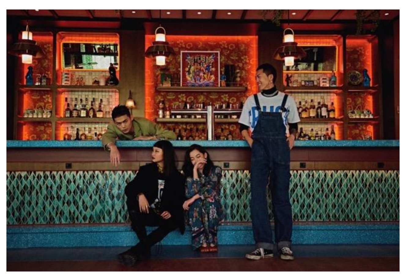
The designers used ceramic tiles in greens, blues, oranges and whites to give the venue a local flavor.