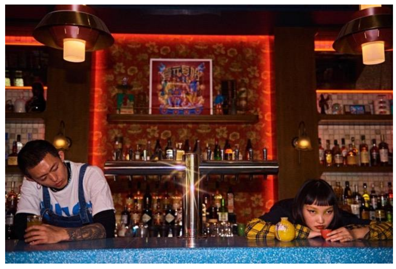
The colorful new nightspot targets Beijing's young and trendy.