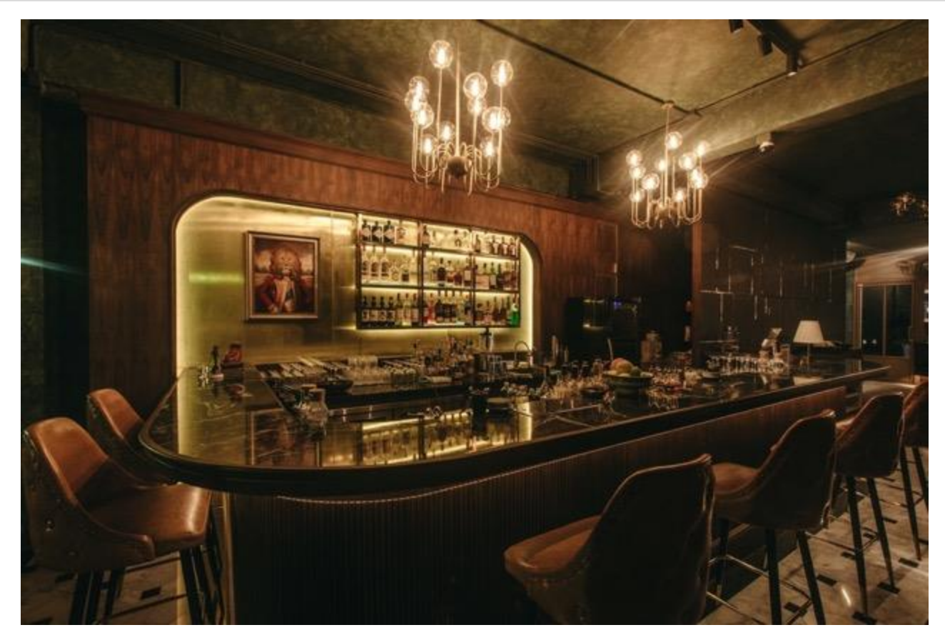
Thai architects, Sasiwimol Utaisup (Jaoh) and Apichaya Krongboonying (Leng) transformed an old commercial building into an English-style bar and restaurant.