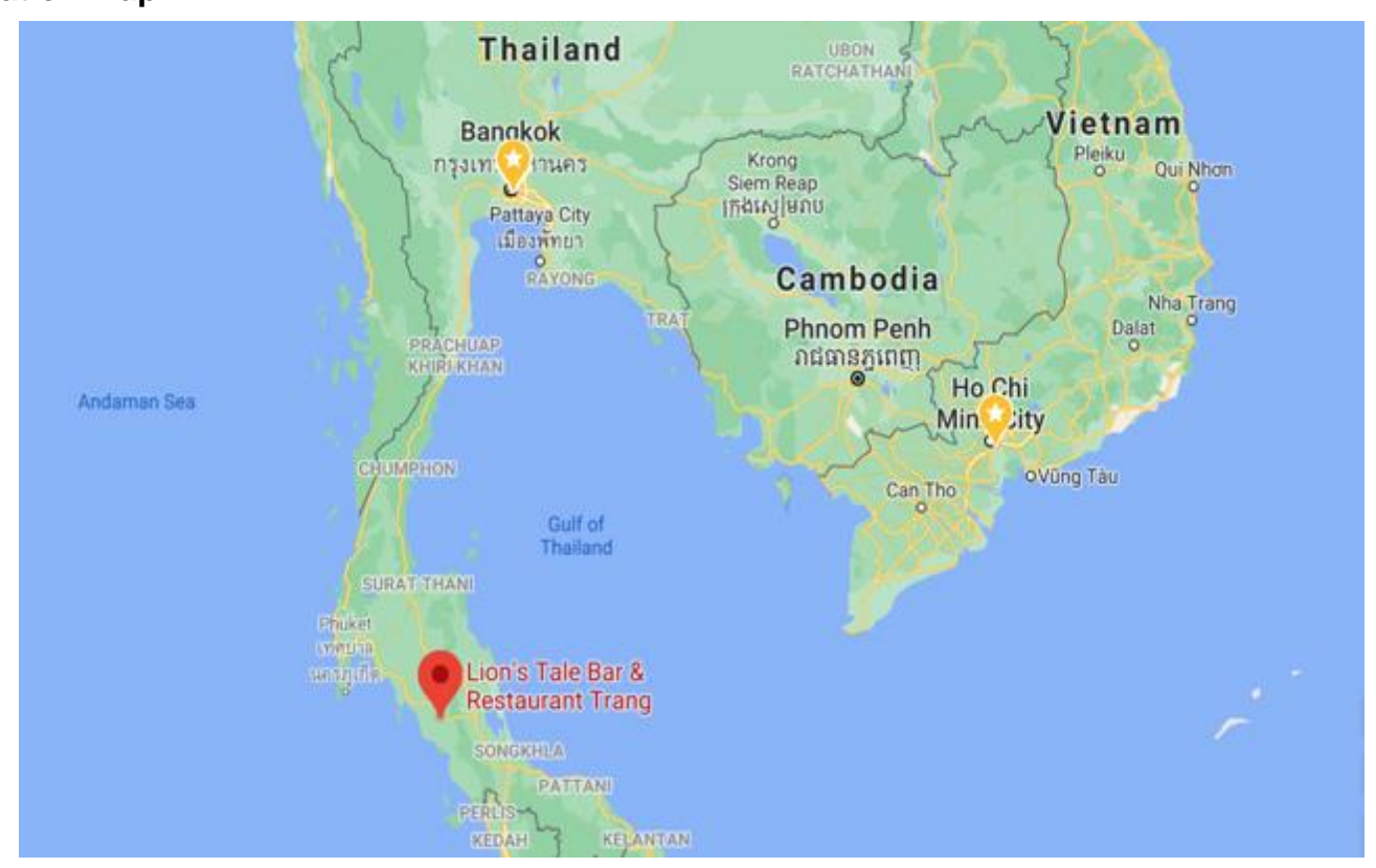
Lion's Tale Bar & Restaurant is located in the center of Trang city in southern Thailand.