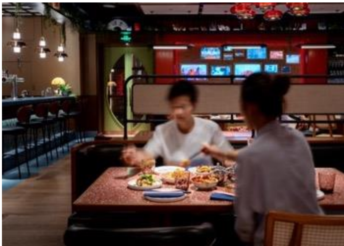
The bar features a video art installation wall.