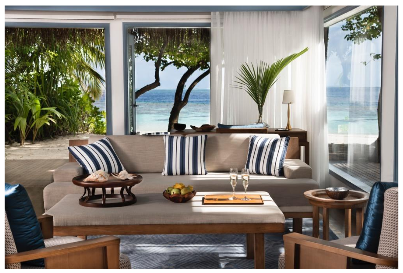
Soaring 7-meter ceilings with exposed beams painted in grey-blue allow natural light to flood into the rooms, easily adjusted with fully retractable blinds that lend the feel of a colonial home.