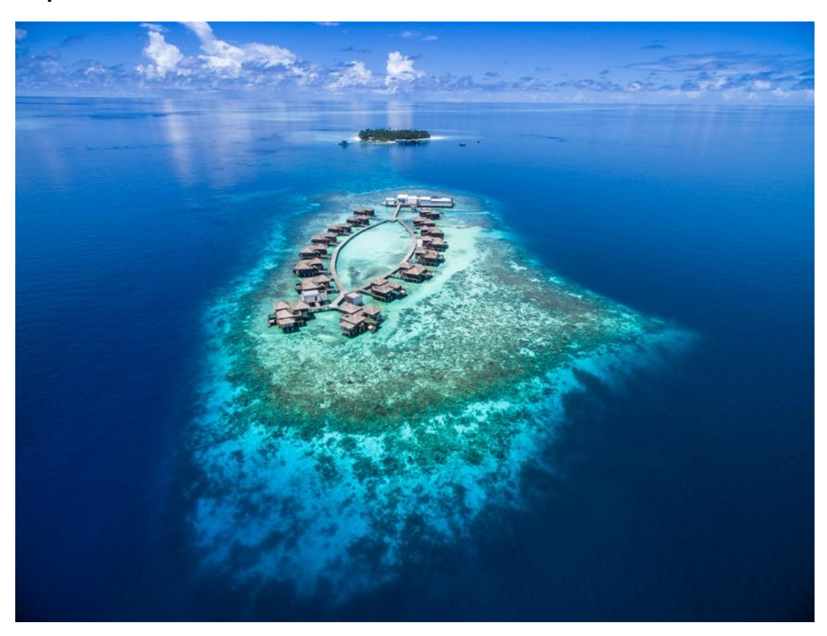
The resort is located in Gaafu Alifu, one of the world's most remote and pristine atolls, found at the southern tip of the Maldives archipelago.