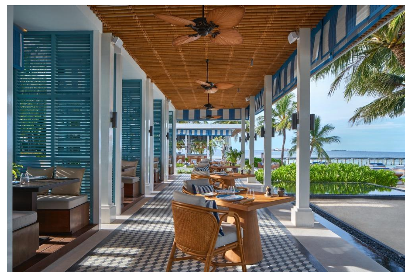
A nod to Raffles' distinct colonial style, striped monsoon blinds and louvered doors and windows, all in a signature grey-blue shade, punctuate public and private spaces.