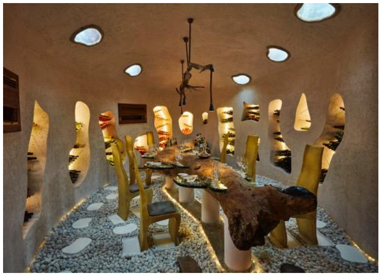
Restaurant and underwater wine cellar.