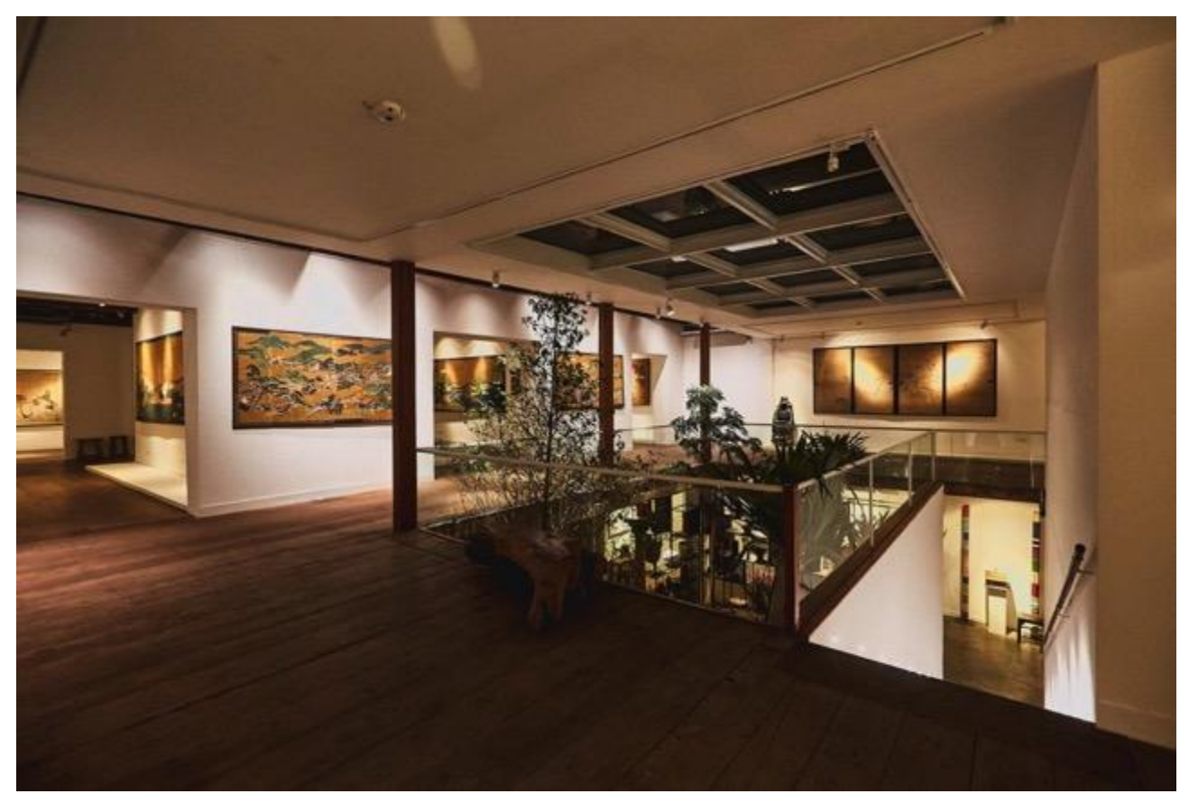
The gallery offers a platform for young, emerging talent.