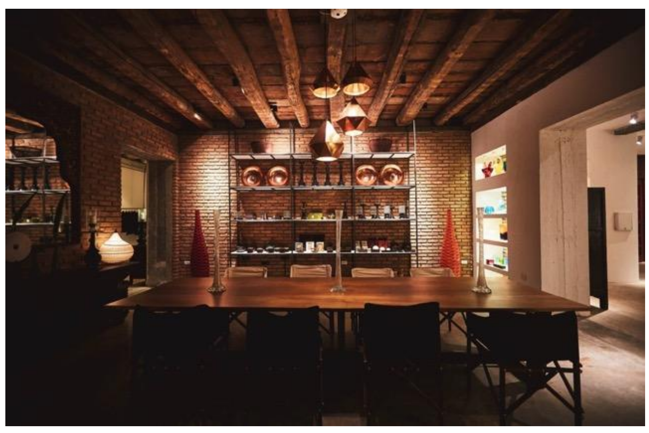
The entire building and structure has been made with reclaimed, recycled, or repurposed materials as much as possible.