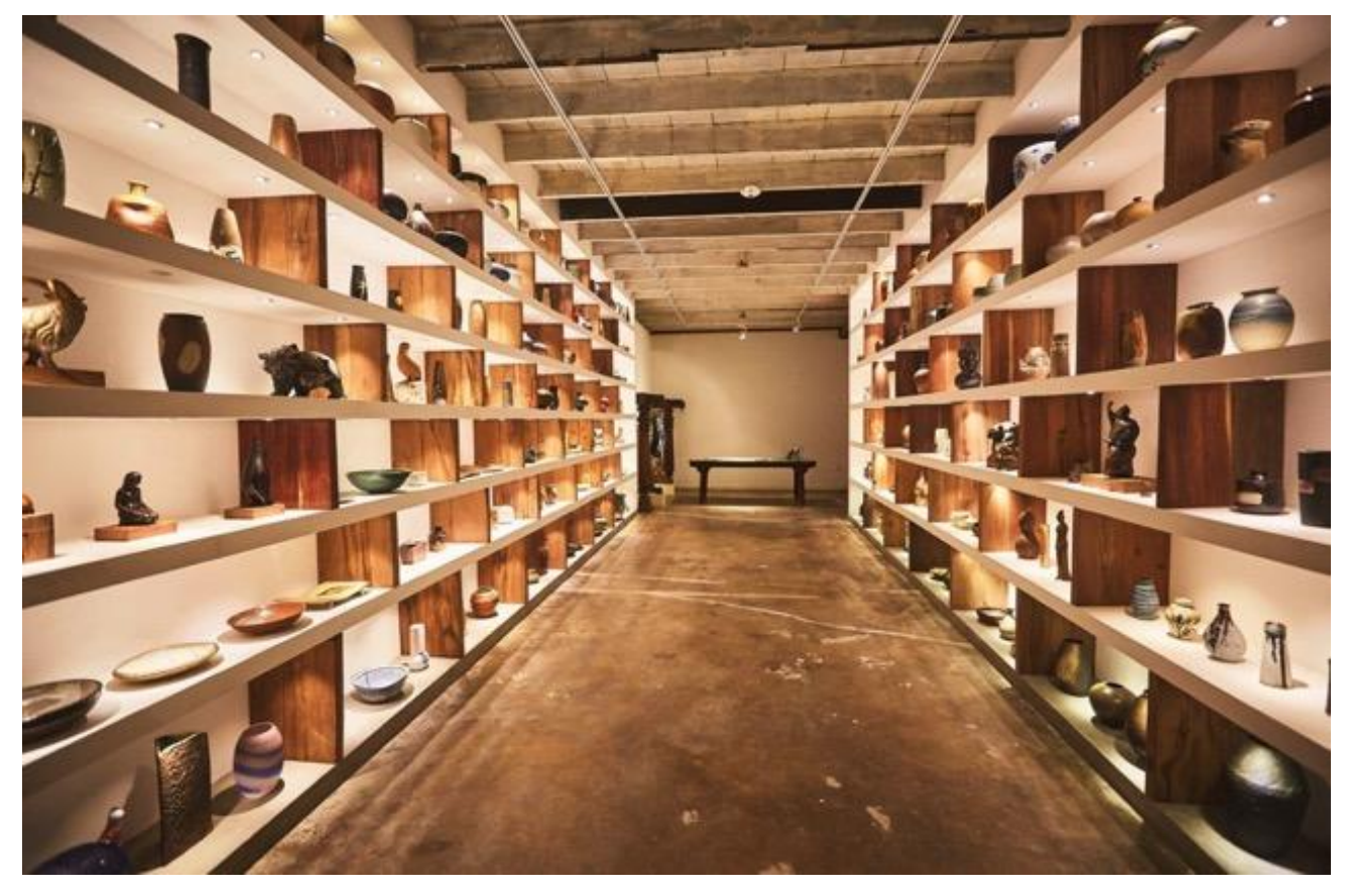
A striking contrast to the venue's old-world ambience is the contemporary art decking of the walls.