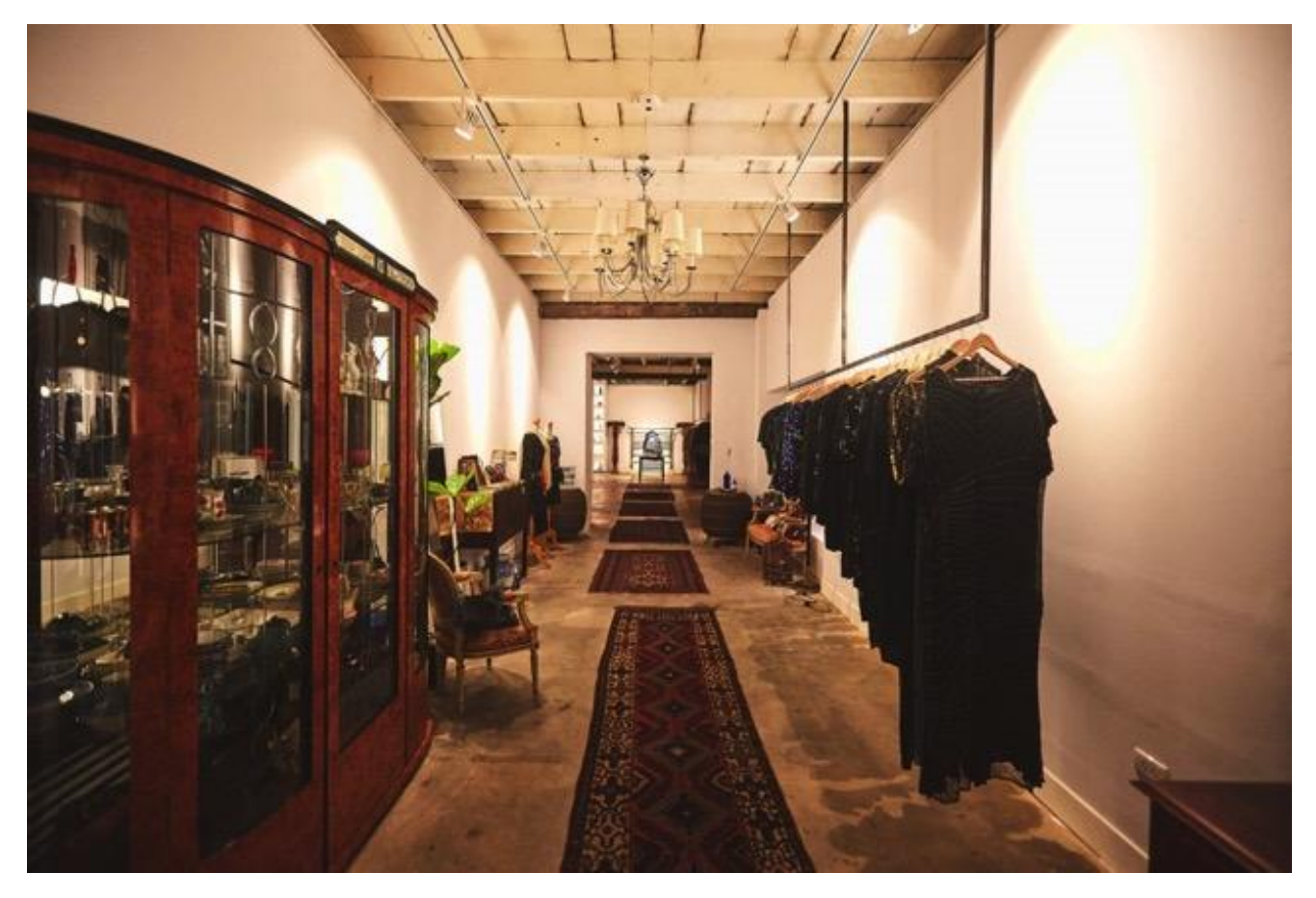
Besides selling ceramics and antiques, ATT 19 also houses a vintage clothing store.