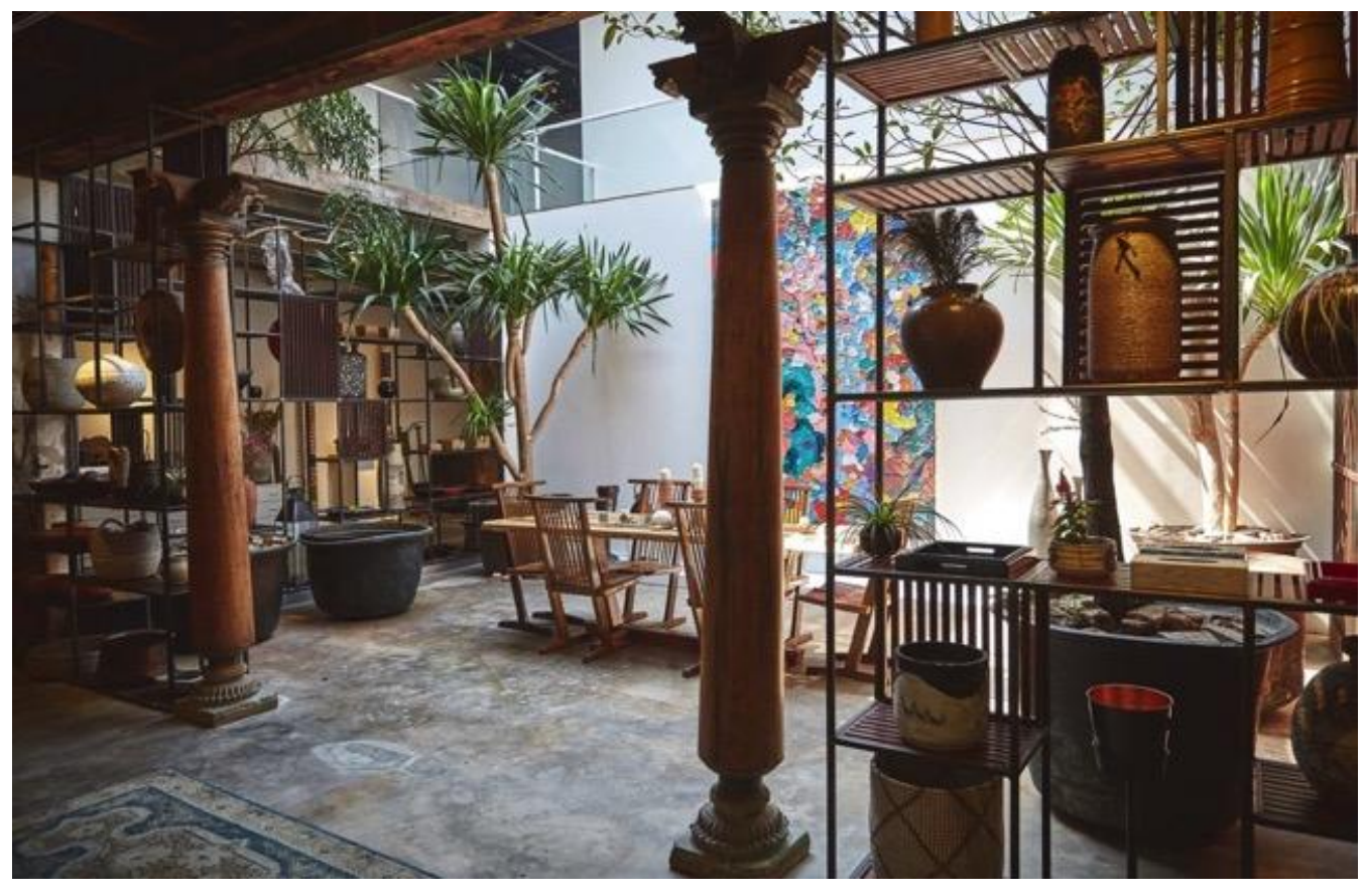
All objects on display are for sale.