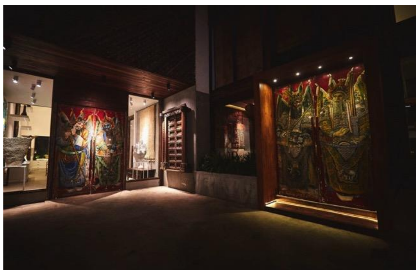
The repurposed doors were originally from a Chinese temple.