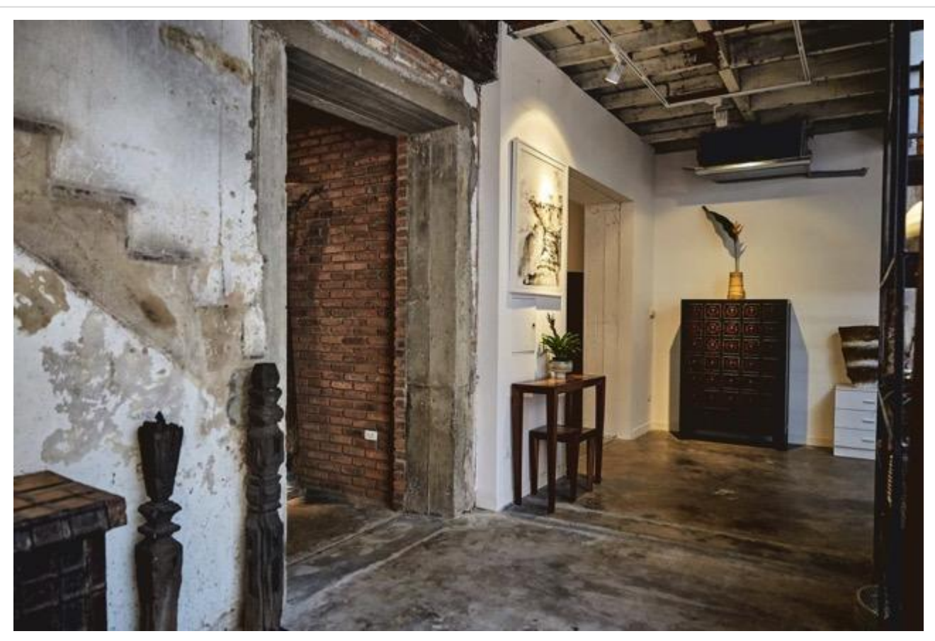
As a homage to its previous life as a Chinese school, the architect left the outline of the staircase intact which used to lead to the classrooms upstairs.