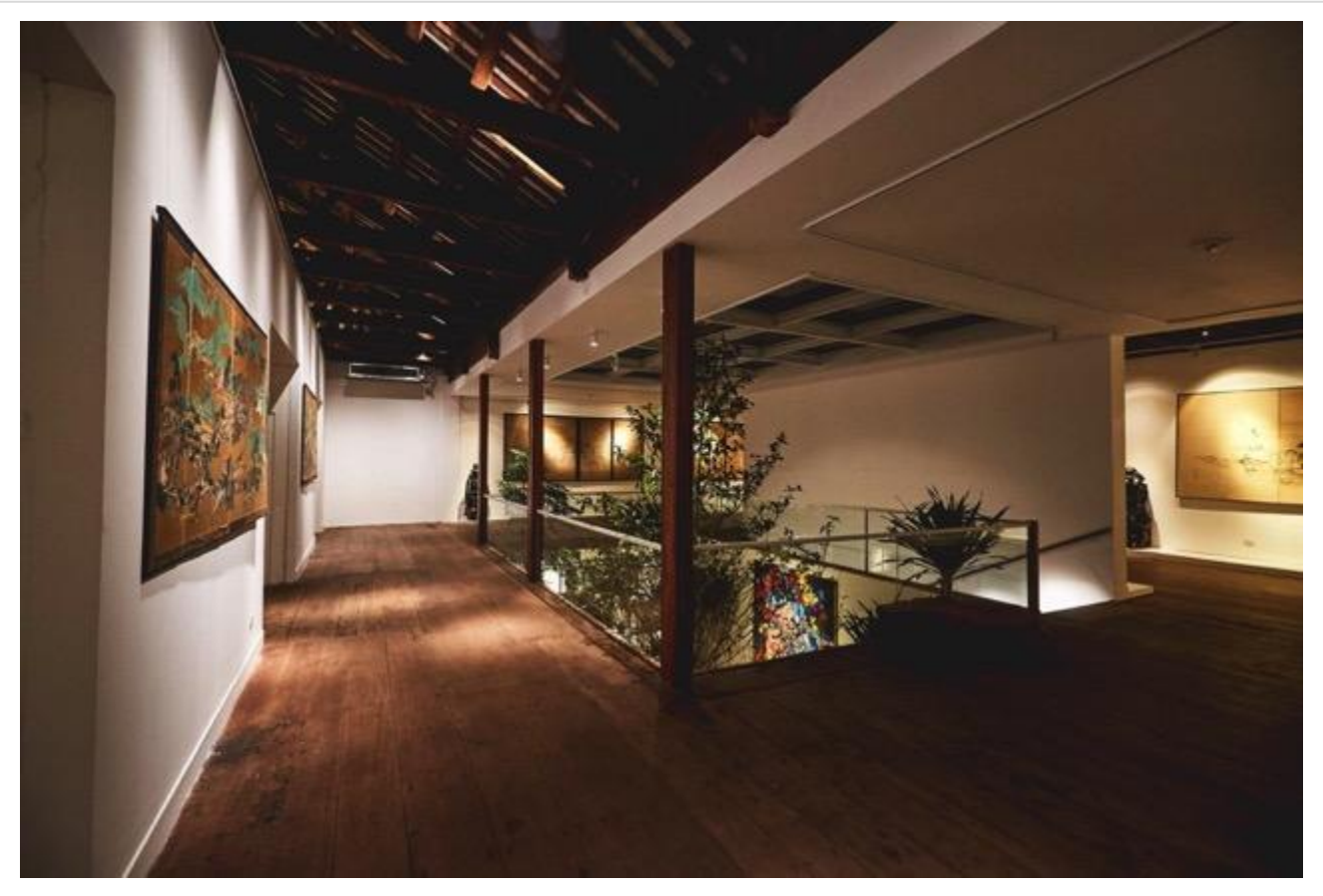
The art gallery upstairs where the classrooms used to be.