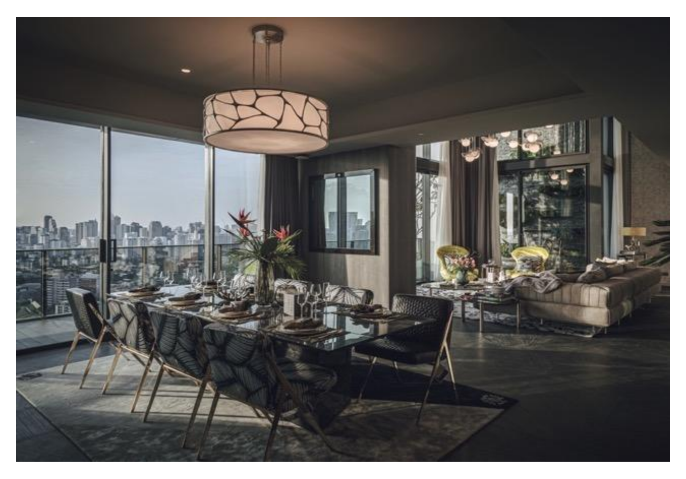
Roberto Cavalli is known for his love of animal prints. The new collection embodies a tropical lush jungle combined with glam-chic.