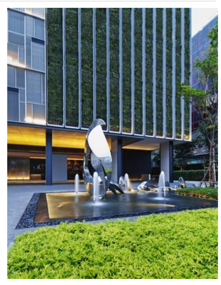
The 32-storey landmark building comprises 84 luxury residences.

The homes range in size between 111 sqm for the 2-bedroom suites, 201 sqm for the 3-bedroom suites, and 235 sqm for the 3-bedroom duplex signature suites;