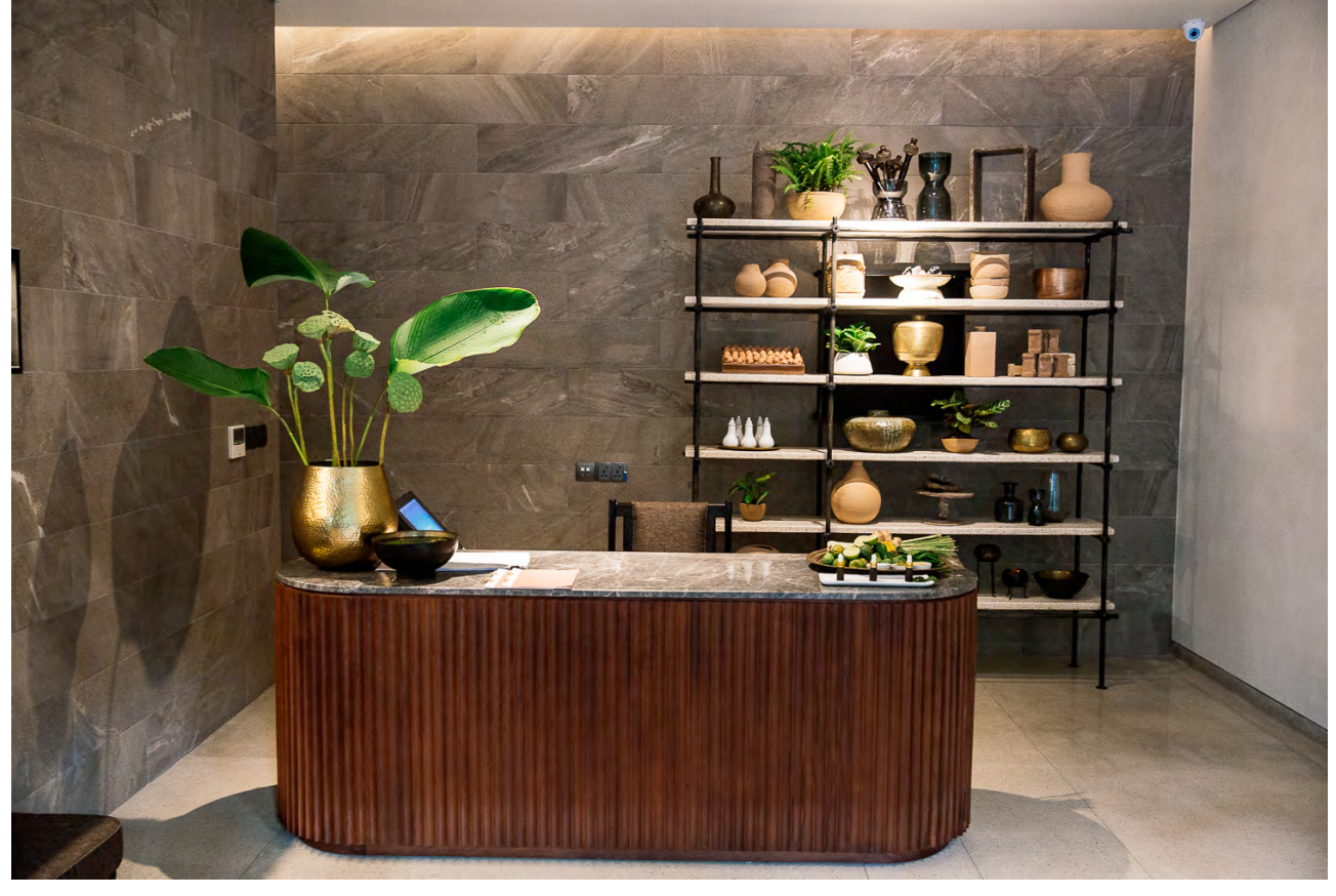
Entrance to the spa.