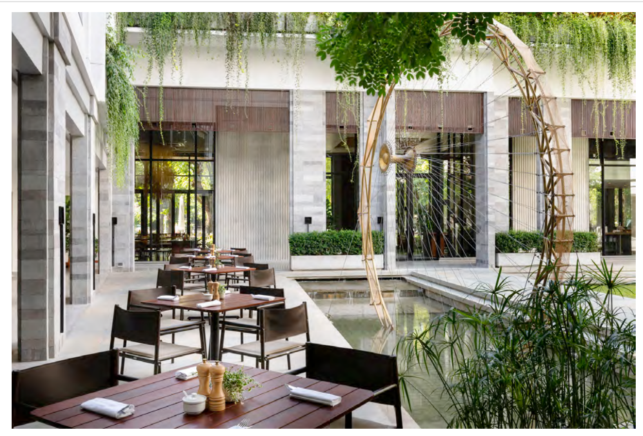
Treeline's most significant feature is its center courtyard, a communal tree-filled space that features a wraparound art gallery and a large cascading water feature.