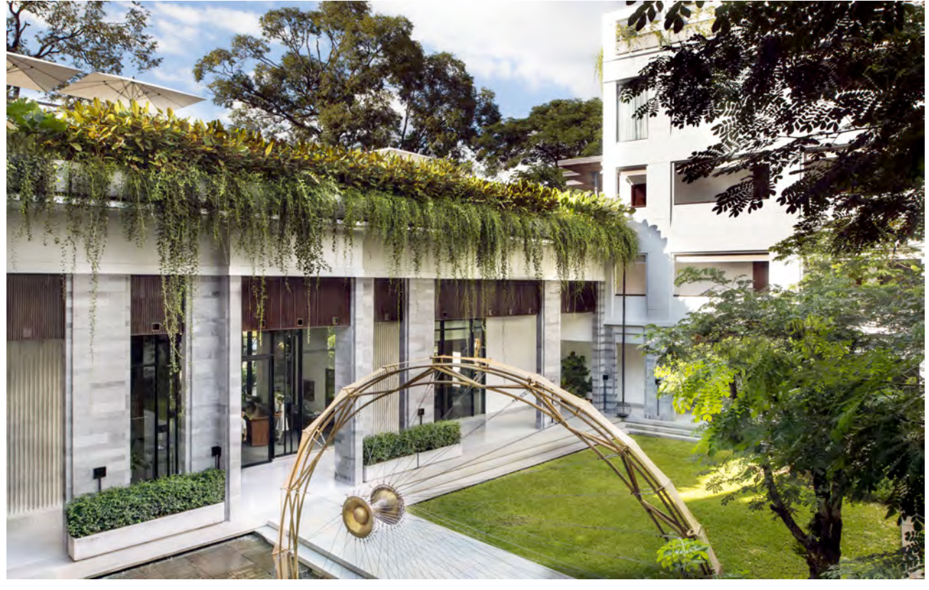
The courtyard is home to a couple of sculptures including the Cosmic Wheel by HKA & Partners, the architect firm behind Treeline.