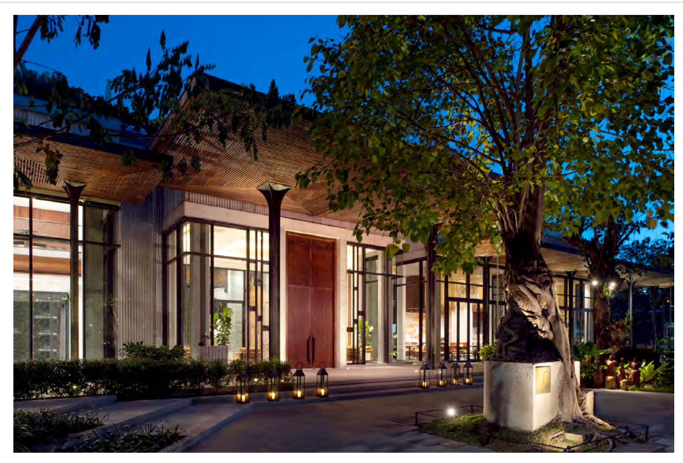
Entrance to the hotel.