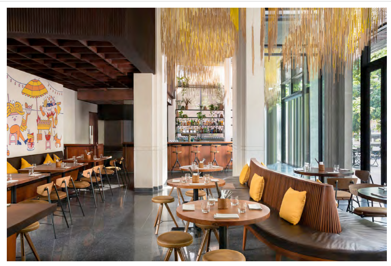
Interior of Hok Noodle Bar