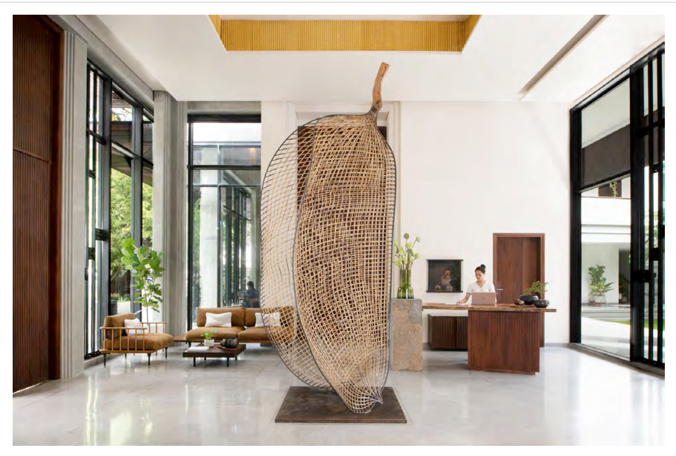
The lobby features Ordette, an installation resembling a seed, by Cambodia's most internationally acclaimed artist, Sopheap Pich.