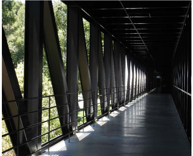
Natural light and shadow produces very nice contrast. Simply semi-gross painted steel structure and polished concrete floor reminds us this space as more like Japanese Zen corridor.