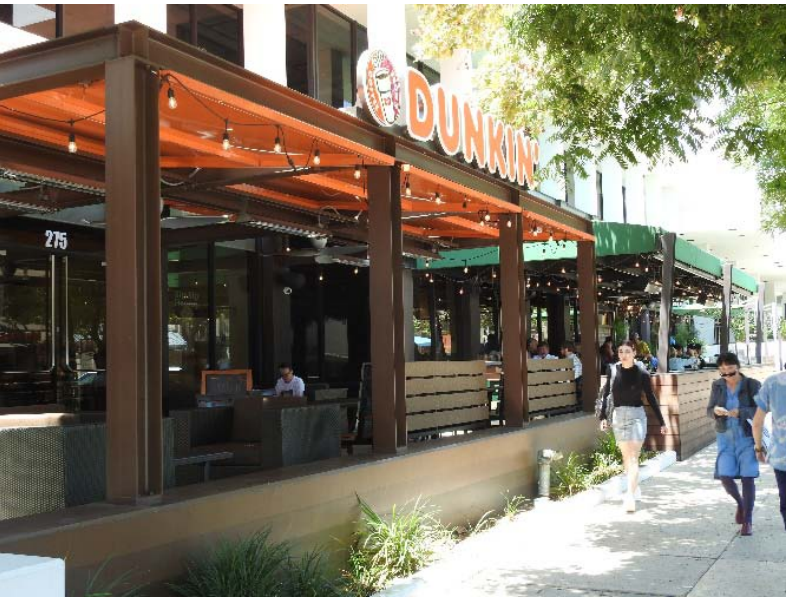
"Lemonade" is a buffet style Salad Bar with soft drinks. Dunkins are slow returner back to California.