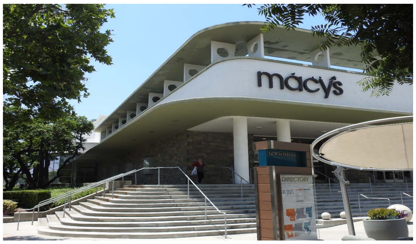
1950's American symbolic architectural design of prestegious retalers. Lerge cantilever canopy, steps and a large set back with landscape.