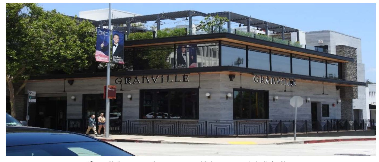
"Granville" upper scale restaurant with its own newly built facility.