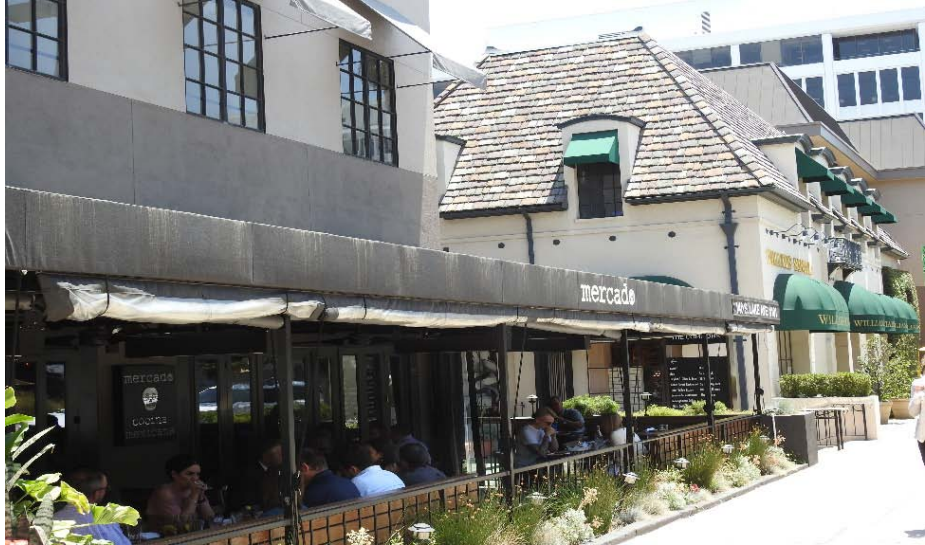
Out of all kinds of European design, English-style design is especially common in Pasadina.