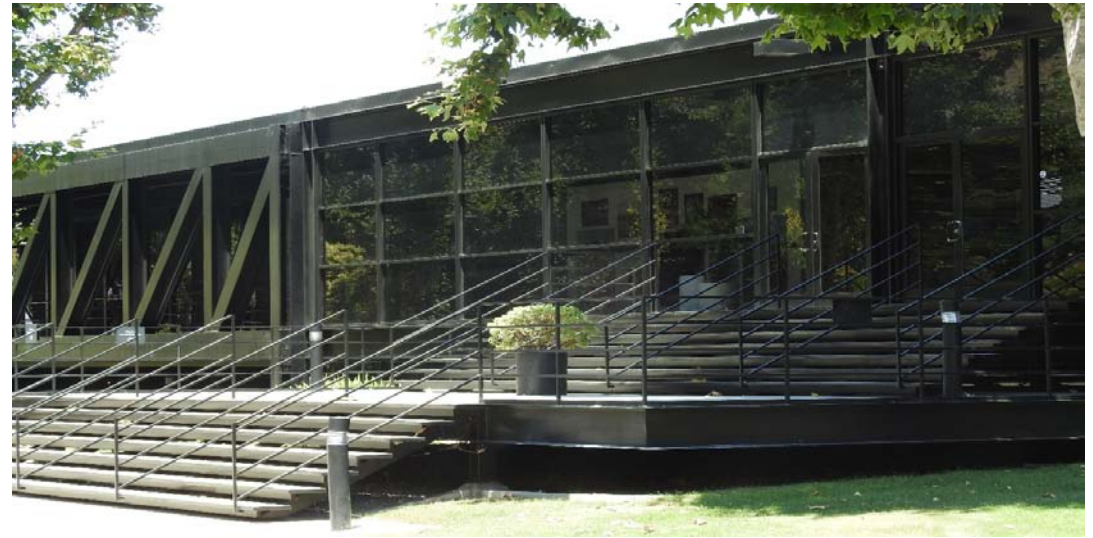
Main entrance to the campus, again the deisgn is very "Chicago, IIT and Miesian"