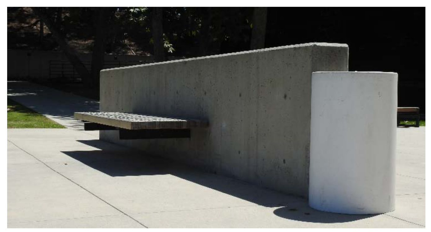
One of the simplest designed out door bench.