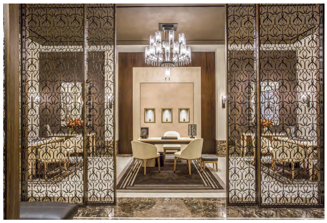
The boutique features a majestic a 5-meter high ceiling adorned with special lighting and a bespoke Baccarat crystal chandelier.