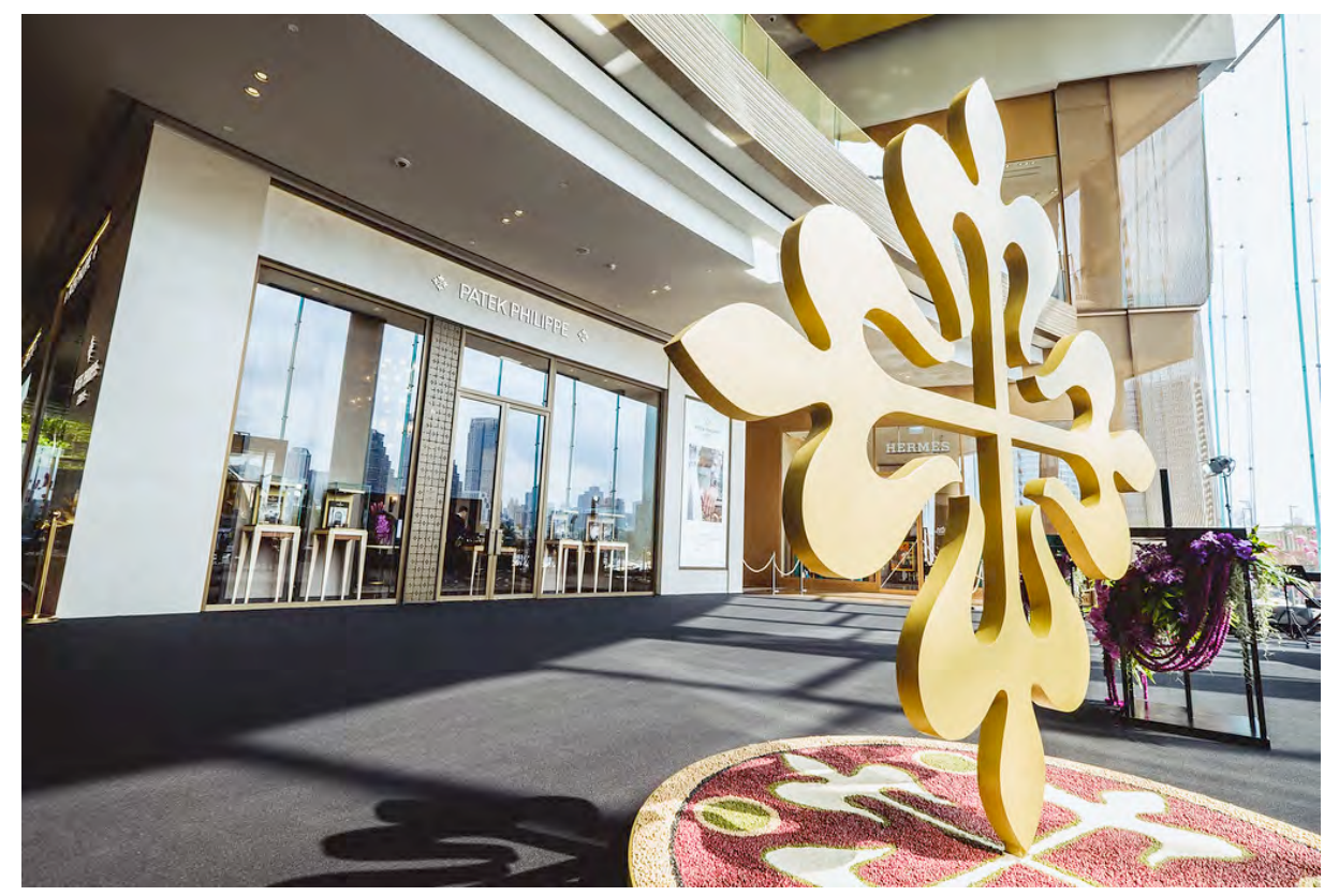
The brand's emblematic Calatrava cross.