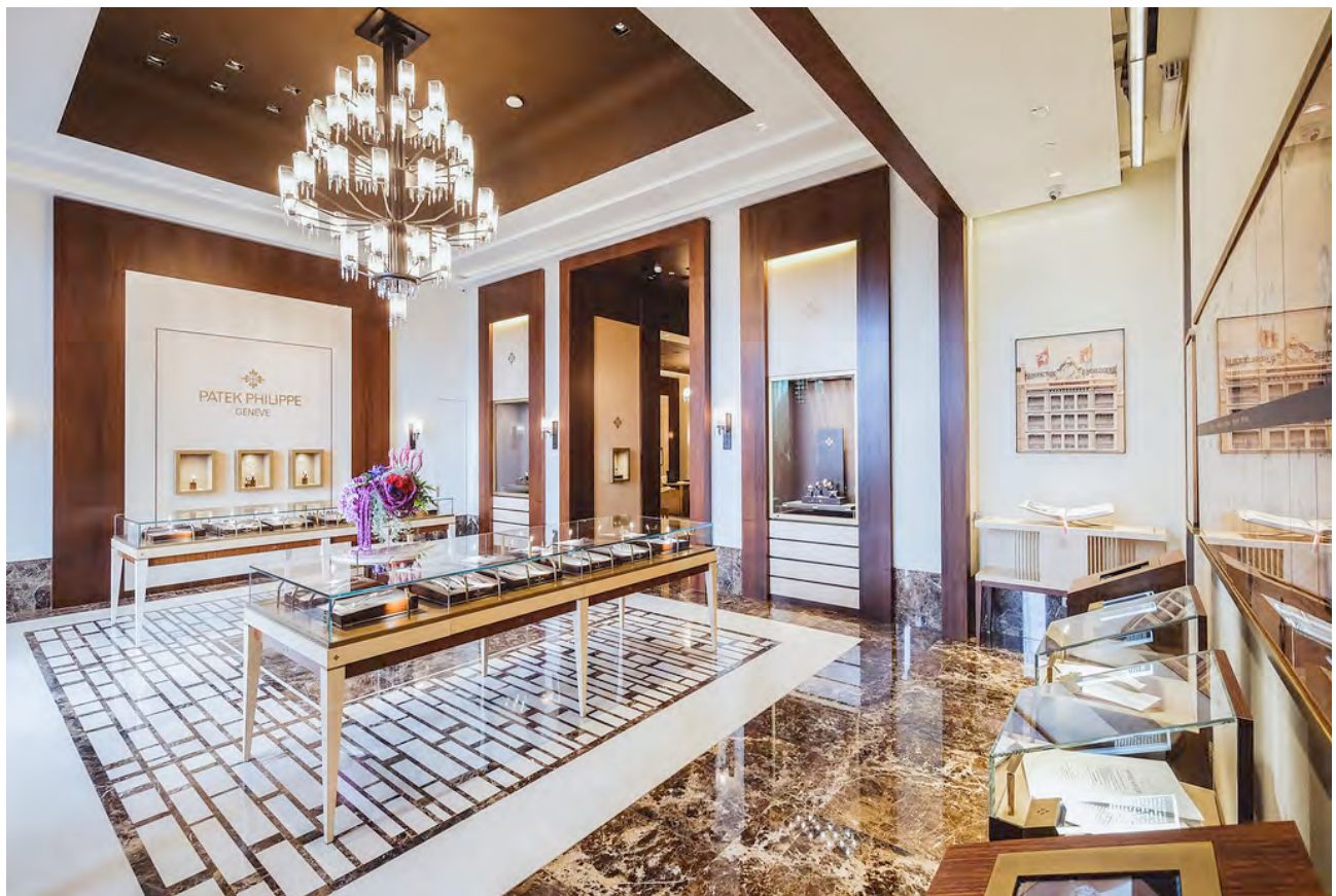
The library within the private lounge is curated with beautiful decorative elements completed with Patek Philippe's horological and historical literature, allowing customers to be further immersed in Patek Philippe's universe.