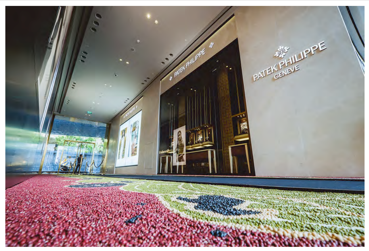
The boutique has a 50-meter façade fitted with a large animated screen backed by a special glass wall with the brand's emblematic Calatrava cross etched in the glass.