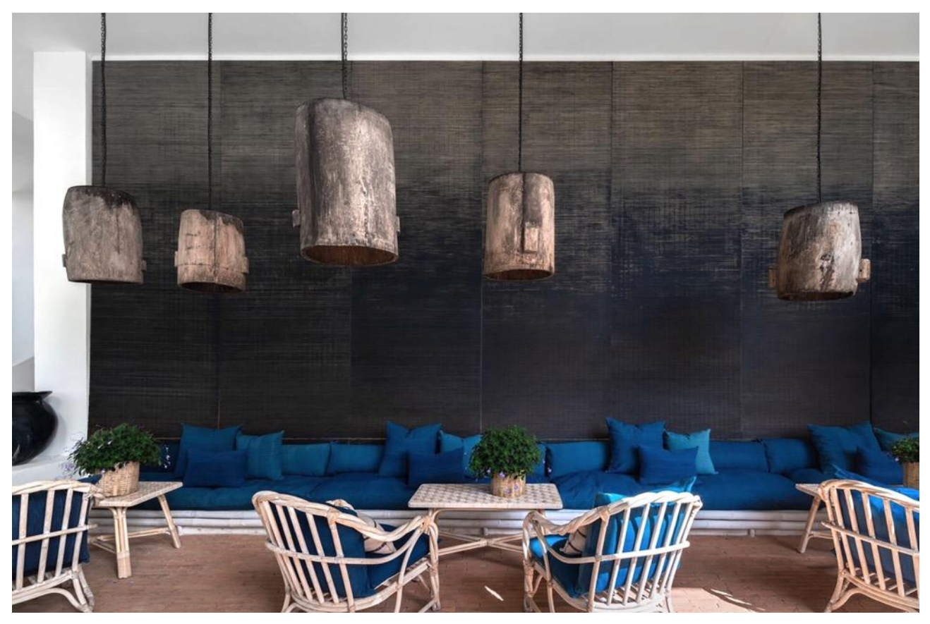
The restaurant has been decorated using traditional elements, such as the lamps and the indigo-dyed pillowcases. All textiles are hand-woven, and the pillows were made by the Karen hill tribe.