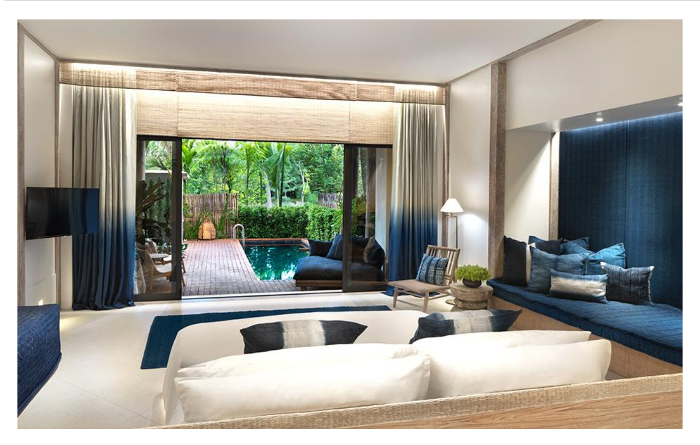
The gradient-colored curtains were especially dyed by Jim Thompson Home Furnishings.