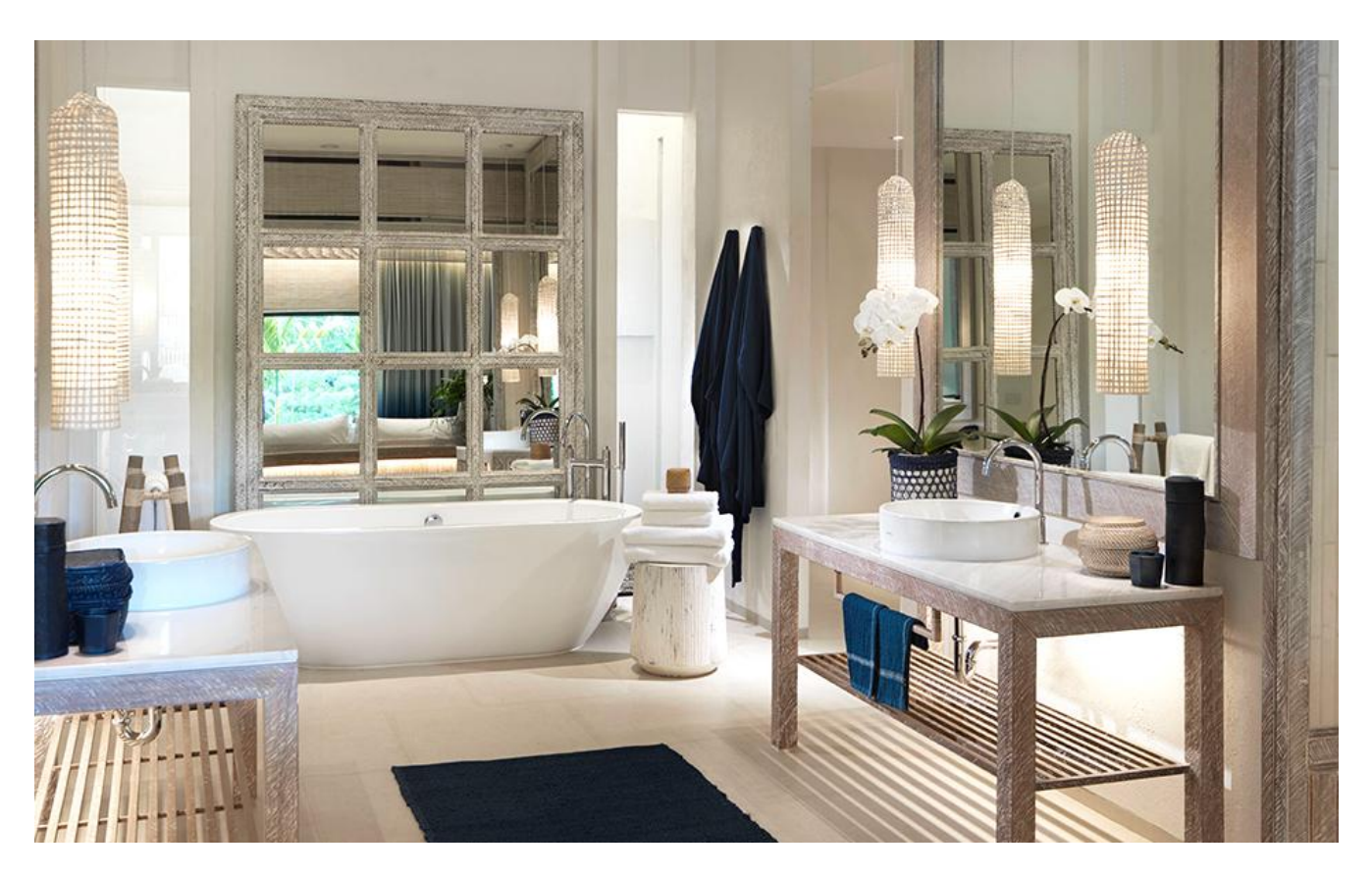
Bathroom at the 100-sqm Pool Suite.