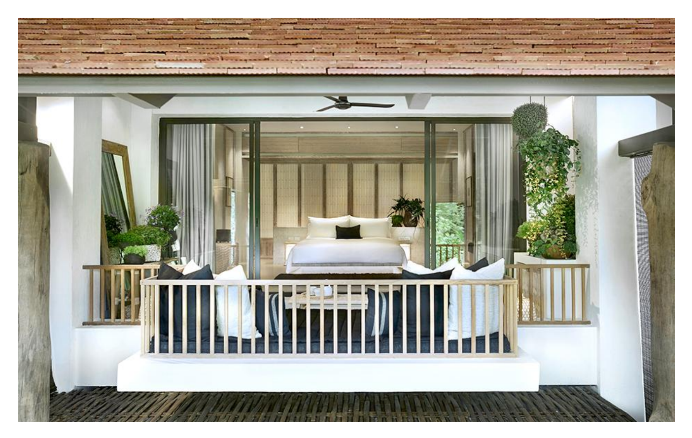
Rin Terrace Suite (75 sqm)