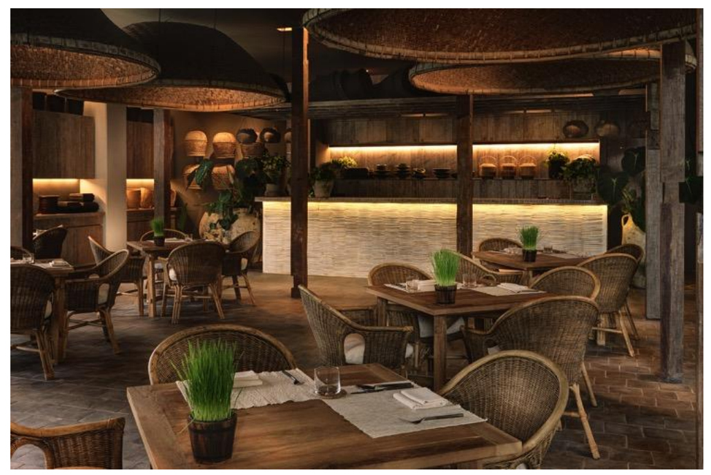
Khu Khao restaurant. The lampshades were originally rice baskets.