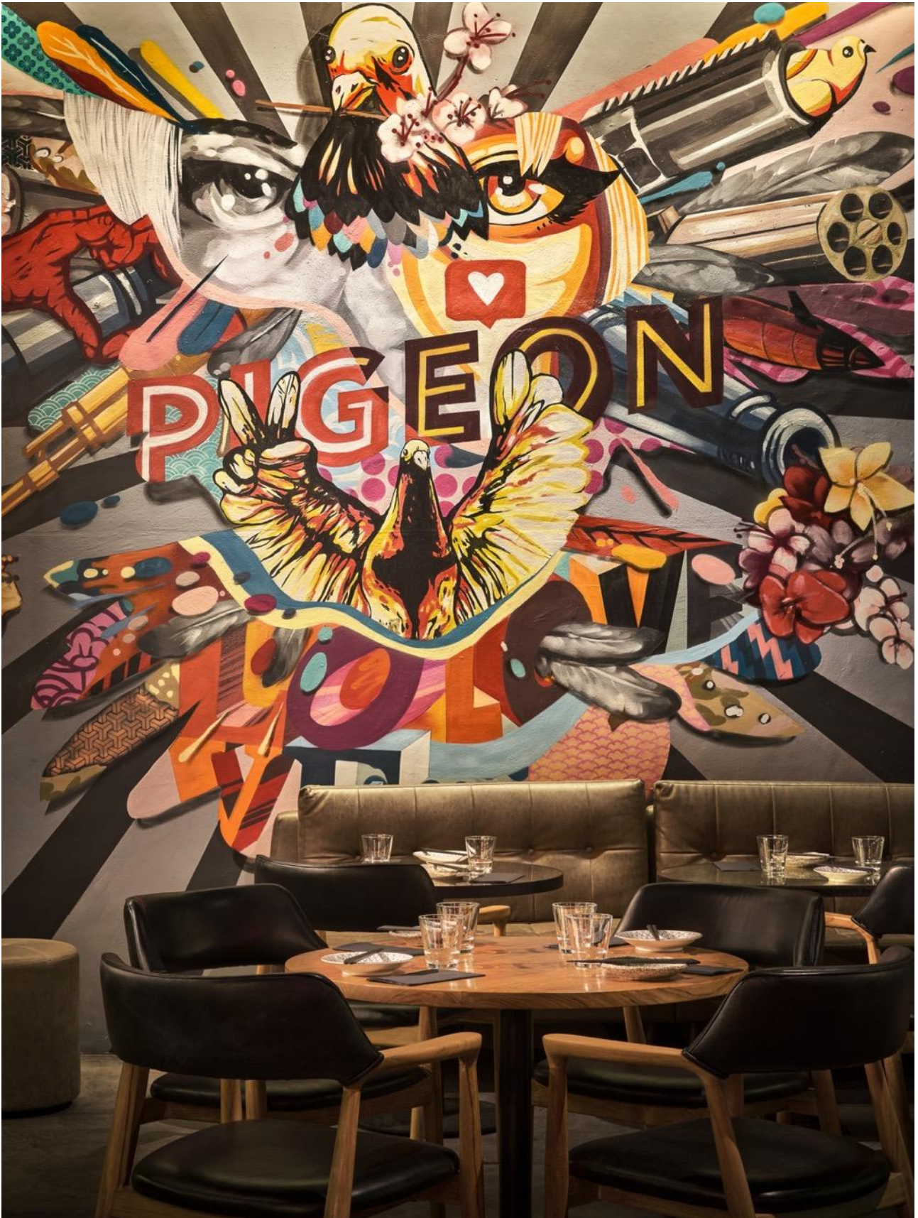
Graffiti is a key design element of Neon Pigeon, highlighted on three walls throughout the establishment.