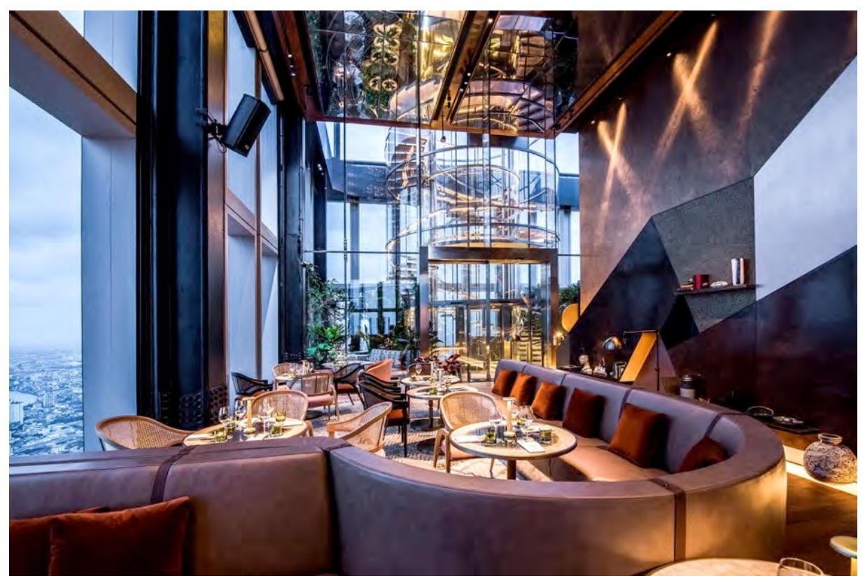
The interiors mix French architectural styles with an elegant touch of Thainess in leather booths, mahogany and warm colors of brick orange and gold—all framed through floor-to-ceiling-windows.