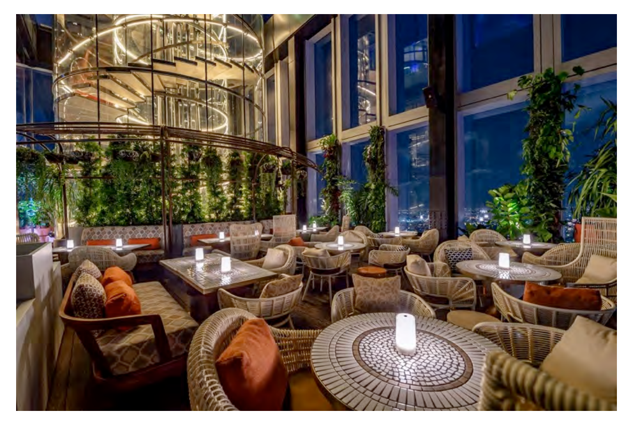
Small tables with bamboo inlays dotted throughout serve as a nod to Thai culture.