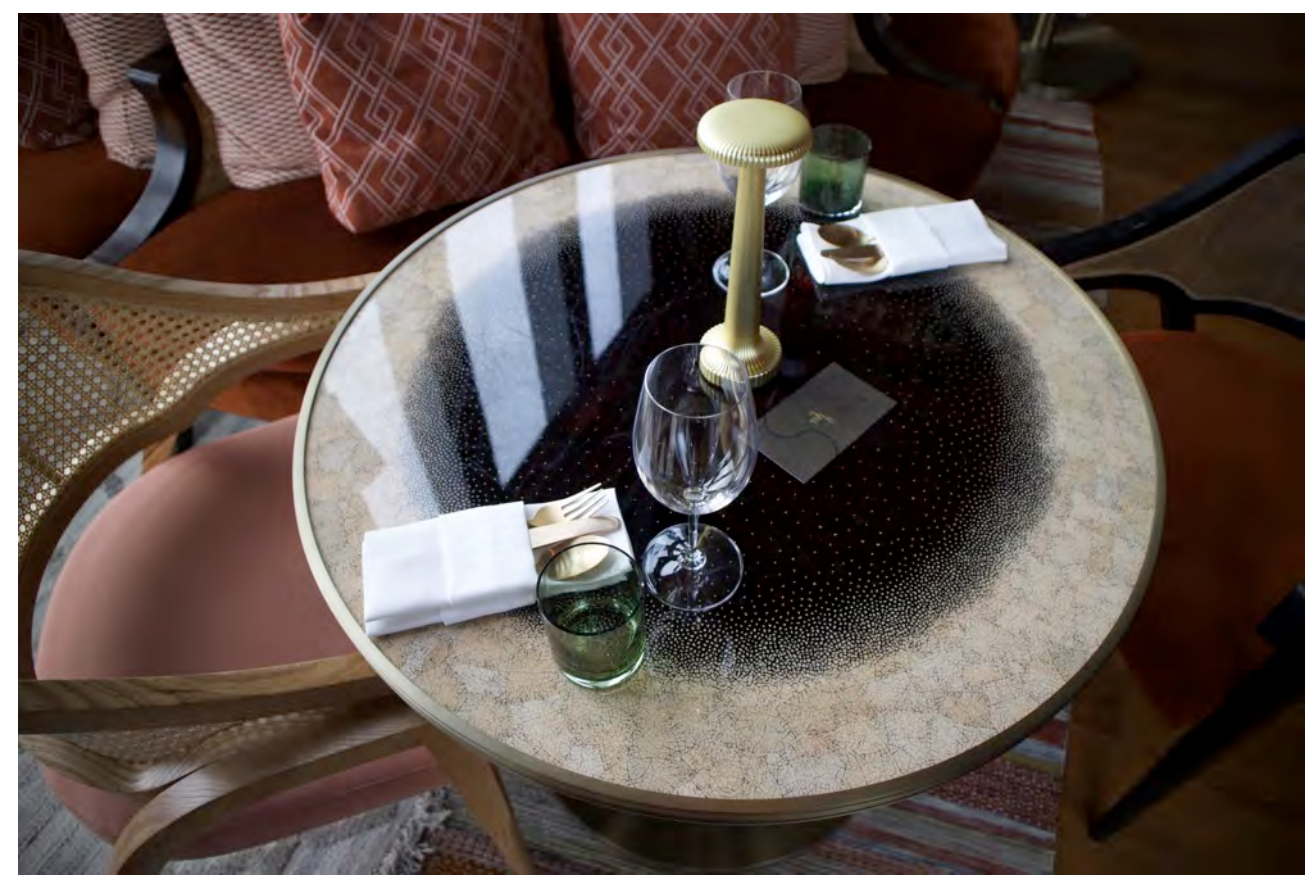
The mosaic tabletop was created using eggshells.