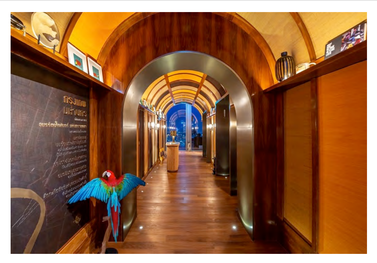
A wooden-paneled corridor extends a warm welcome to arriving guests.