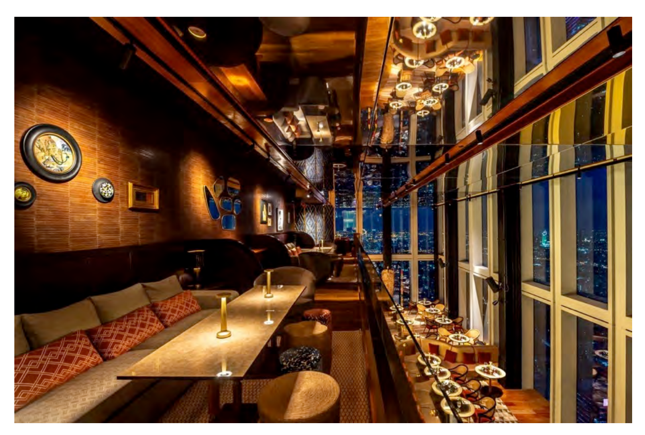
A 9-person VIP lounge and spacious mezzanine sits atop a patchwork lacquer staircase, echoing the warm color palette found throughout Mahanakhon Bangkok SkyBar's interior.