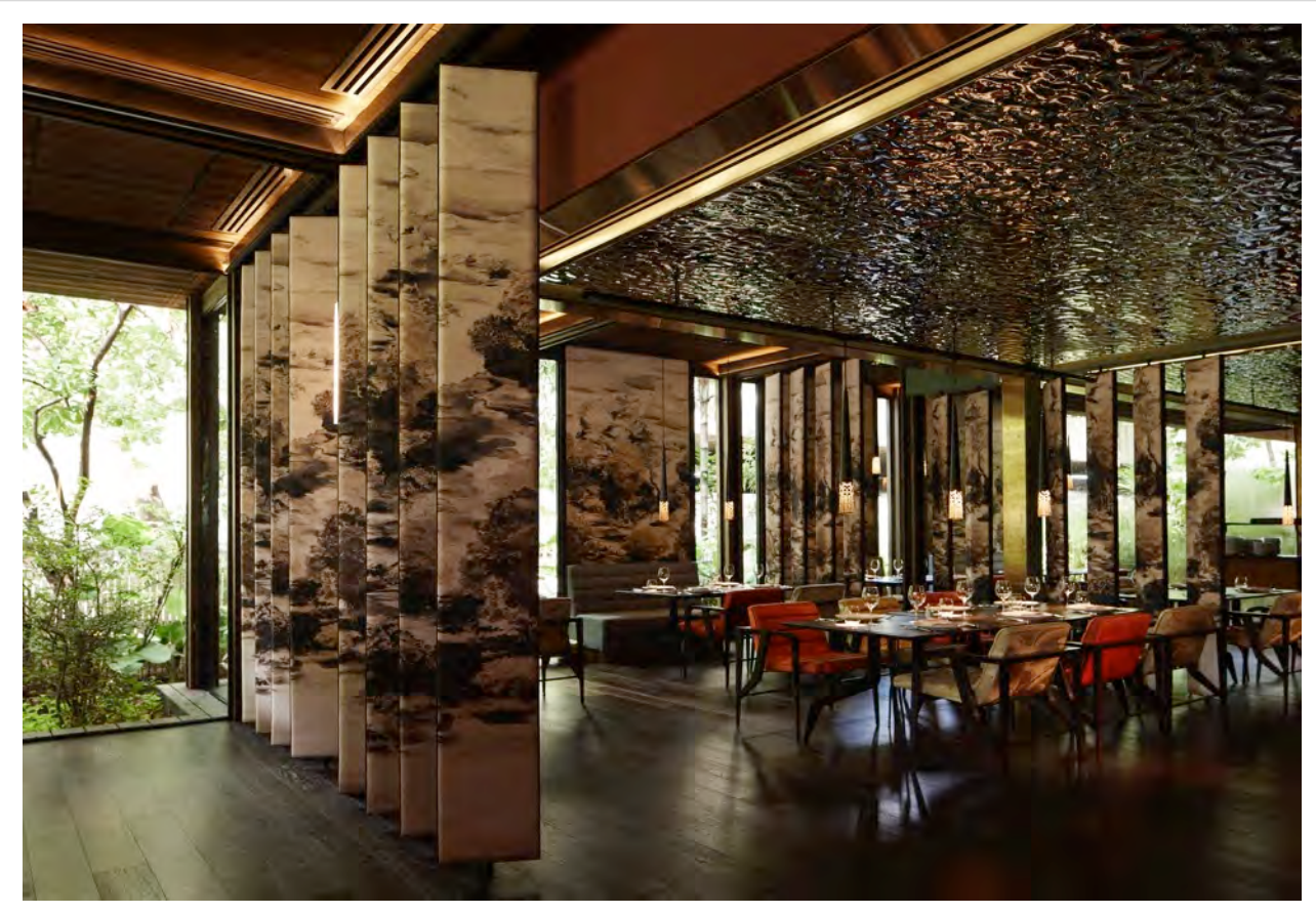
The pivoting panels covered in silks from the Jim Thompson collection reveal or conceal different spaces in the dining room.