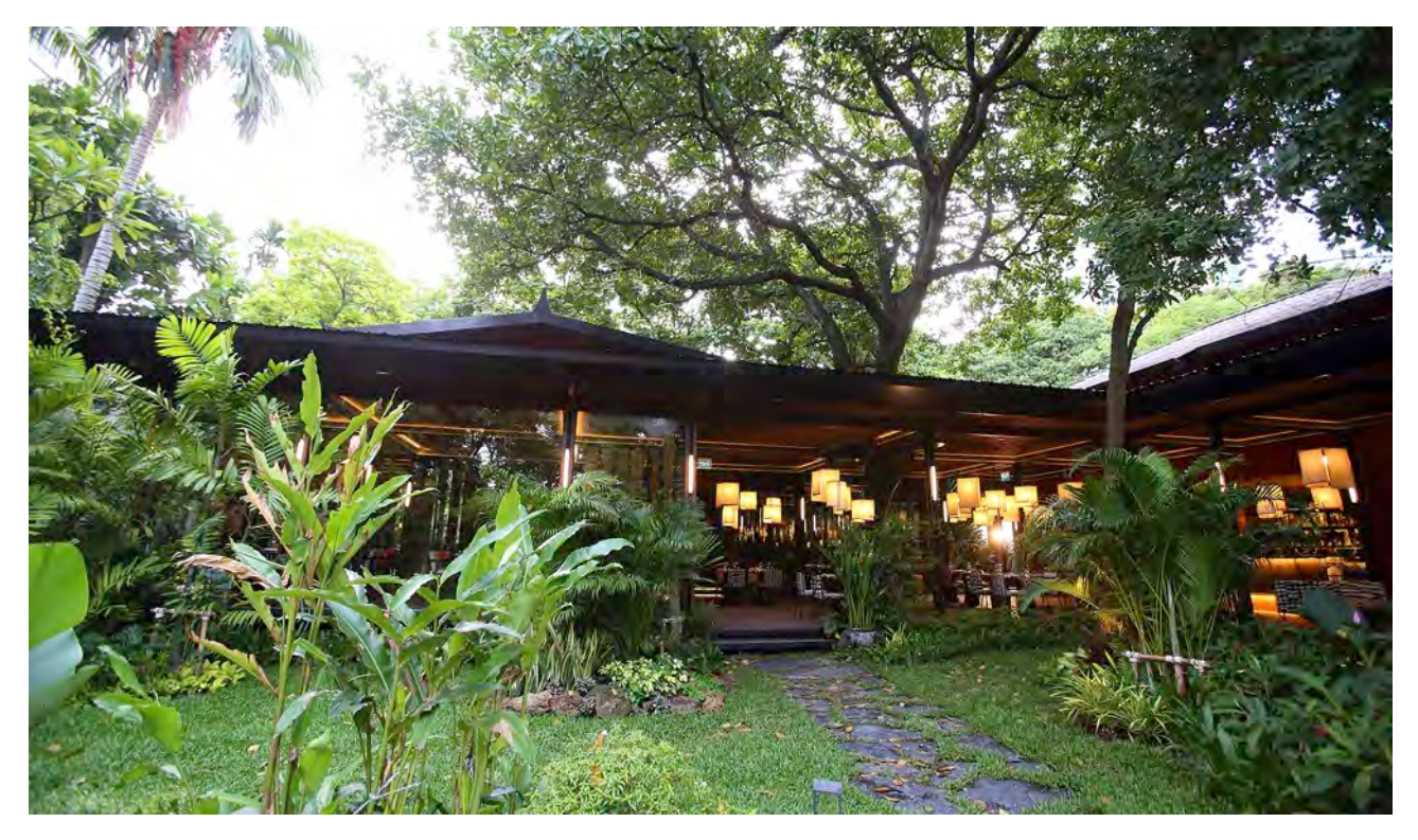
The restaurant is set in a preserved lush green garden, with a covered patio space to offer guests a respite from the urban jungle of Bangkok.