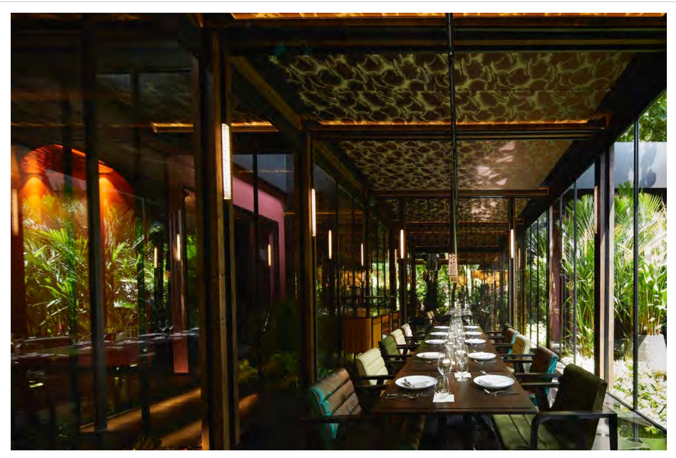
The floor-to-ceiling windows, the reflections of the stainless steel panels in the ceiling, the use of tropical woods, and the use of fragments of ceramic and stone, all enhance the ambiance.