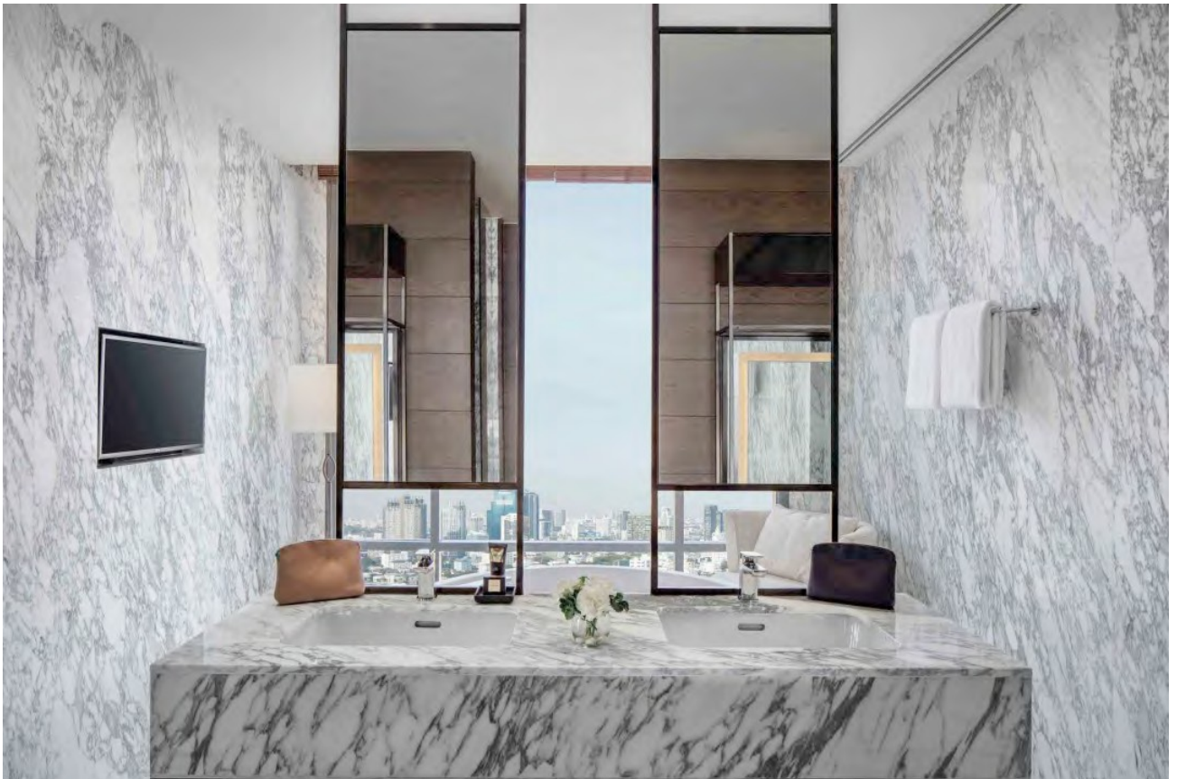
Thonburi Suite bathroom