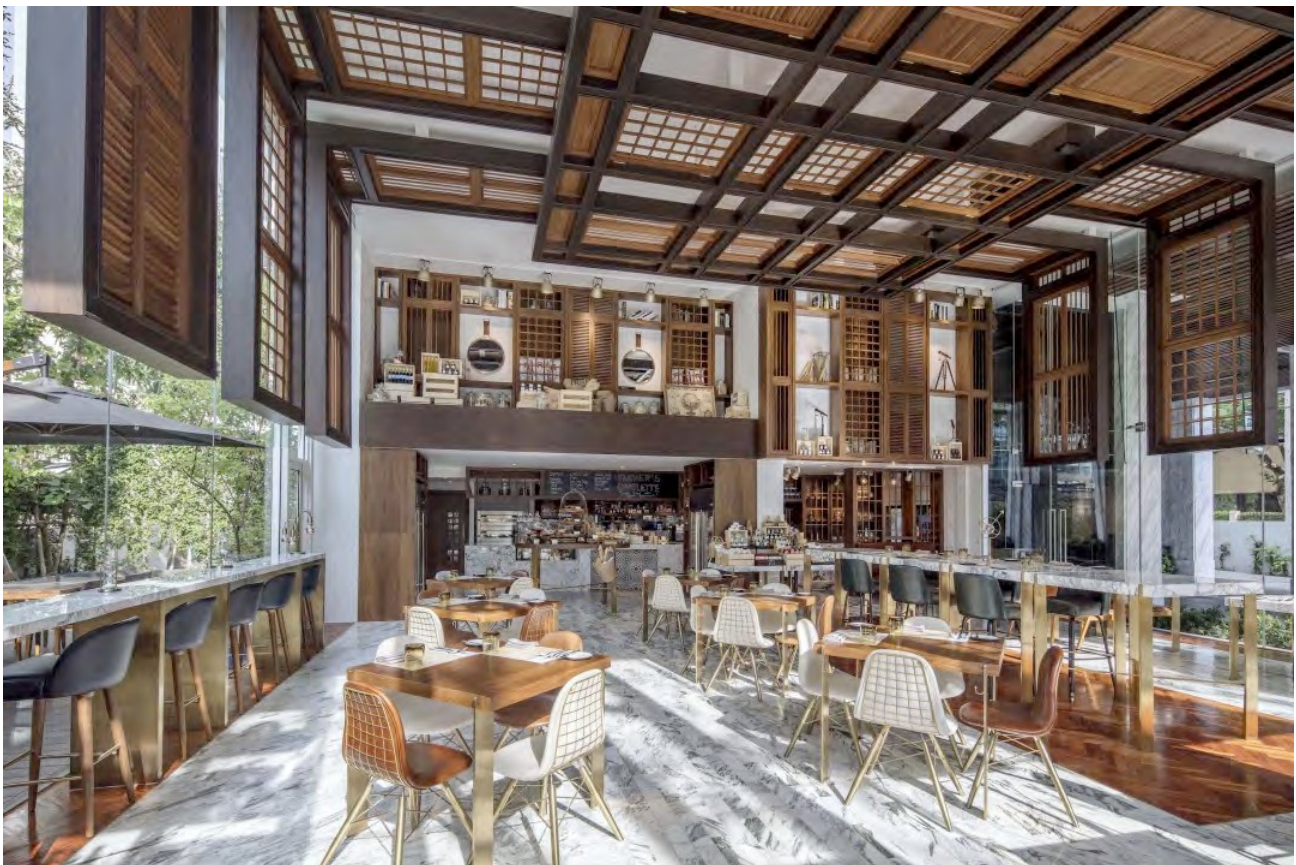
Bangkok Trading Post Bistro & Deli