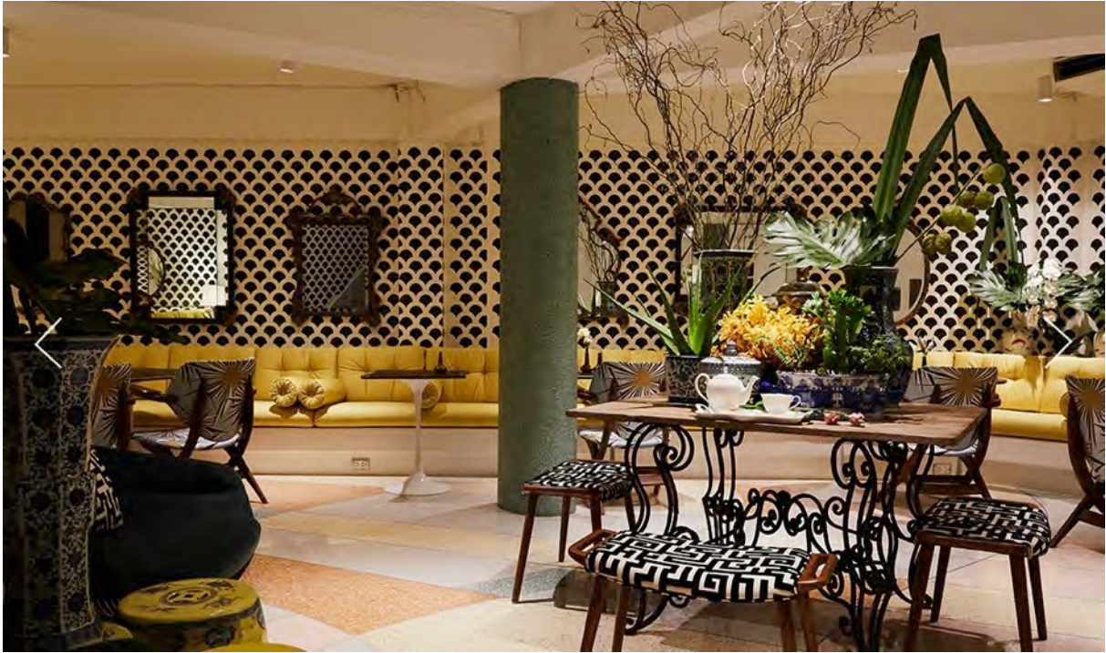
The space's terrazzo floors and mid-century furniture pieces are upholstered in velvet or bold, graphic prints.