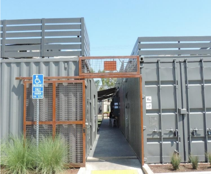
View from the exterior, entrance.