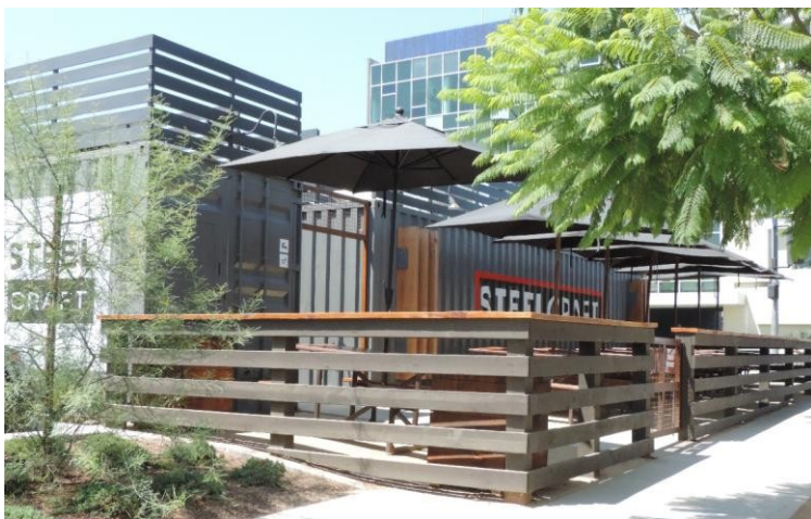
Some more seats