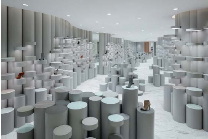
Display for women's shoes and bags on ground floor.