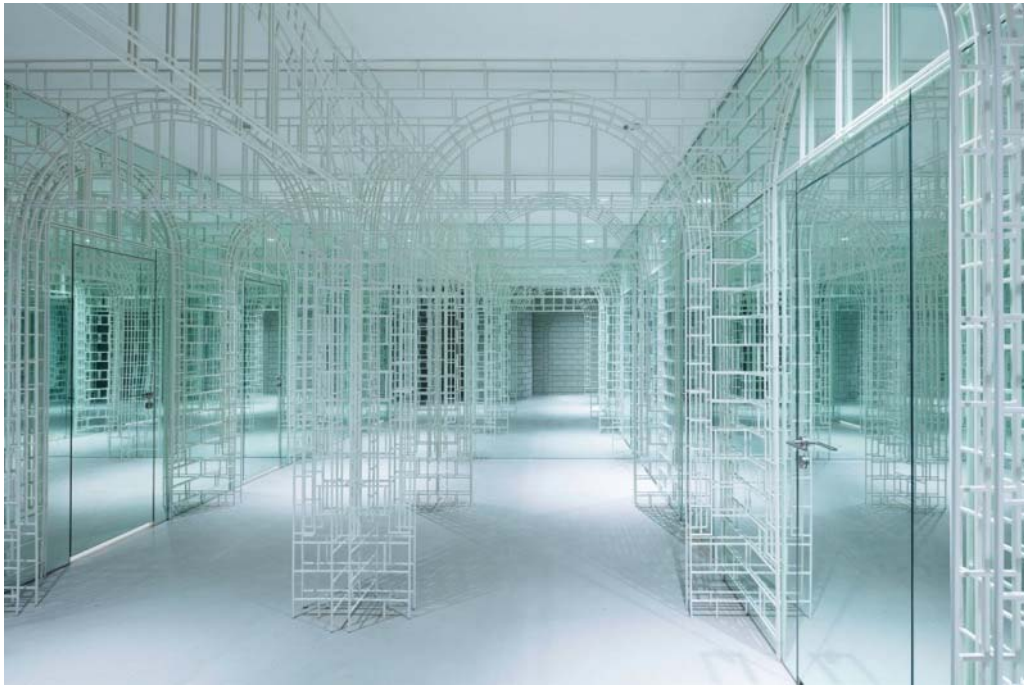
The women's dressing room is a dizzying palace of mirrors.