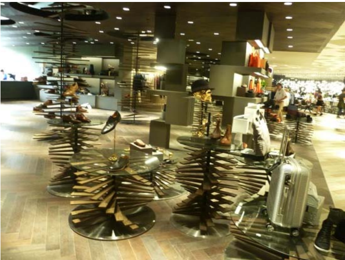
Display for men's shoes.