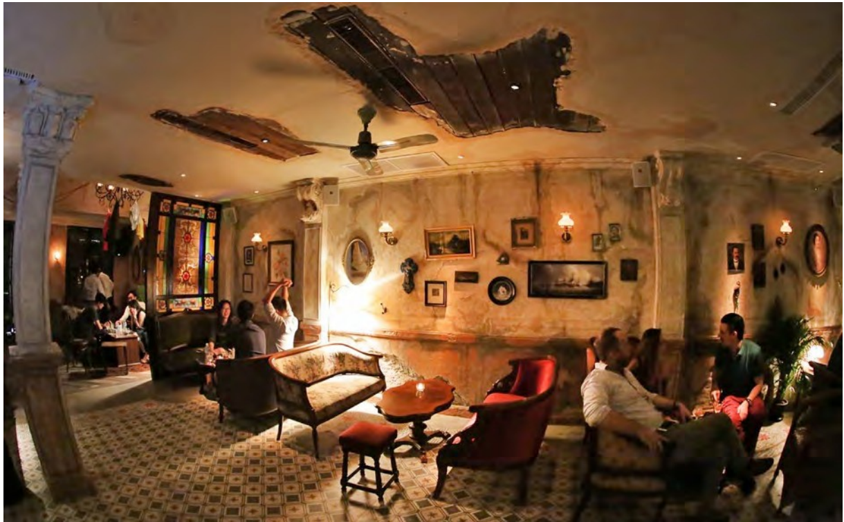
Going for a 1940s-50s Havana high-life vibe, the interior has shuttered windows, spare lighting and crumbling walls spruced up with colorful cement tiles and murals.