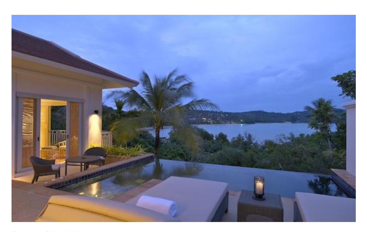
Exterior of Pool Villa