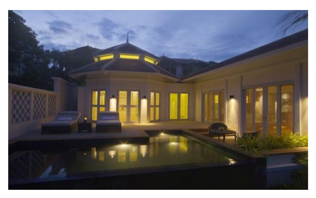
Exterior of Pool Villa