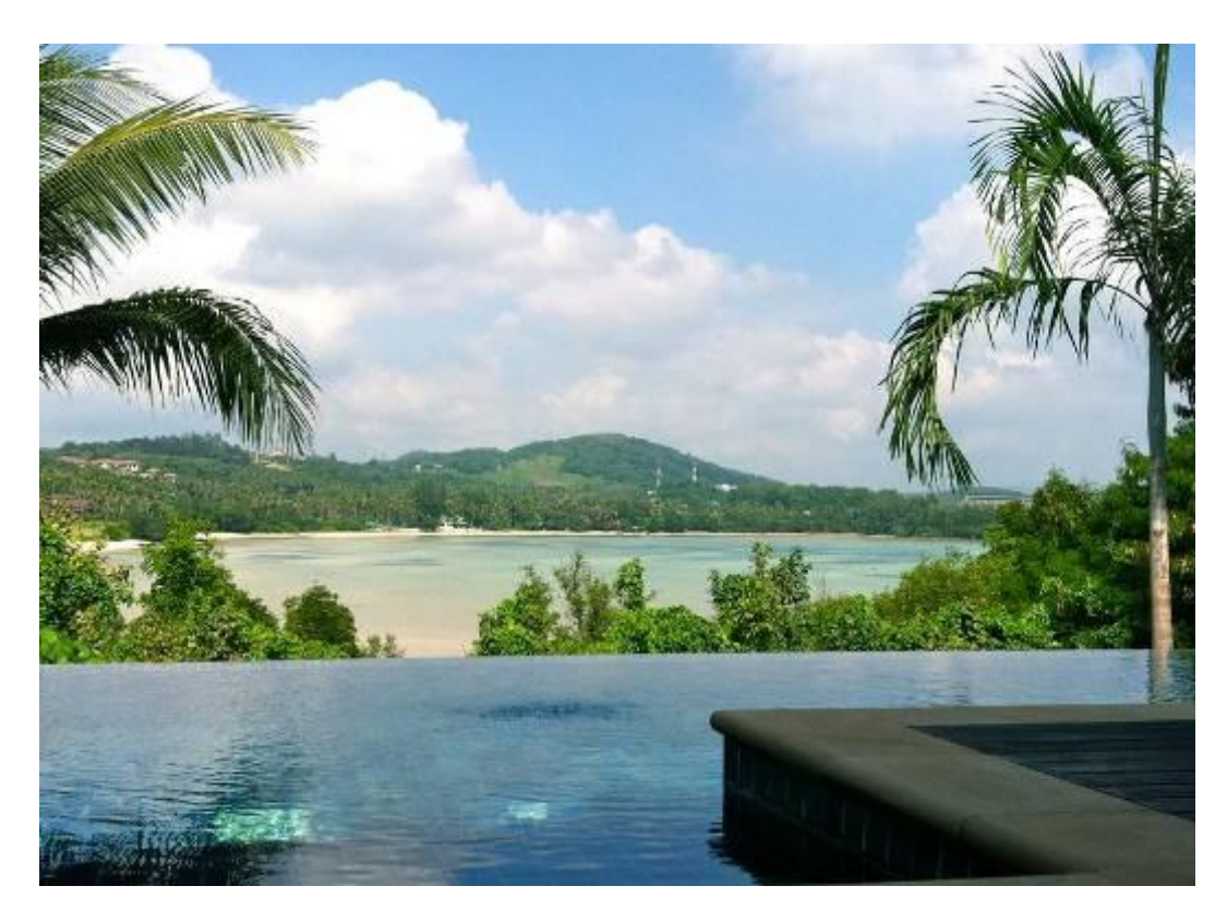
Infinity pool of Pool Villa