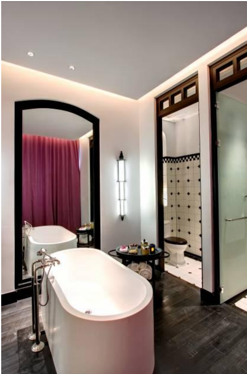
Maenam Suite bathroom