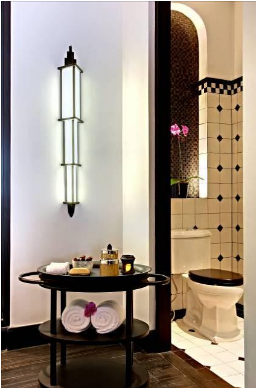
Maenam Suite bathroom