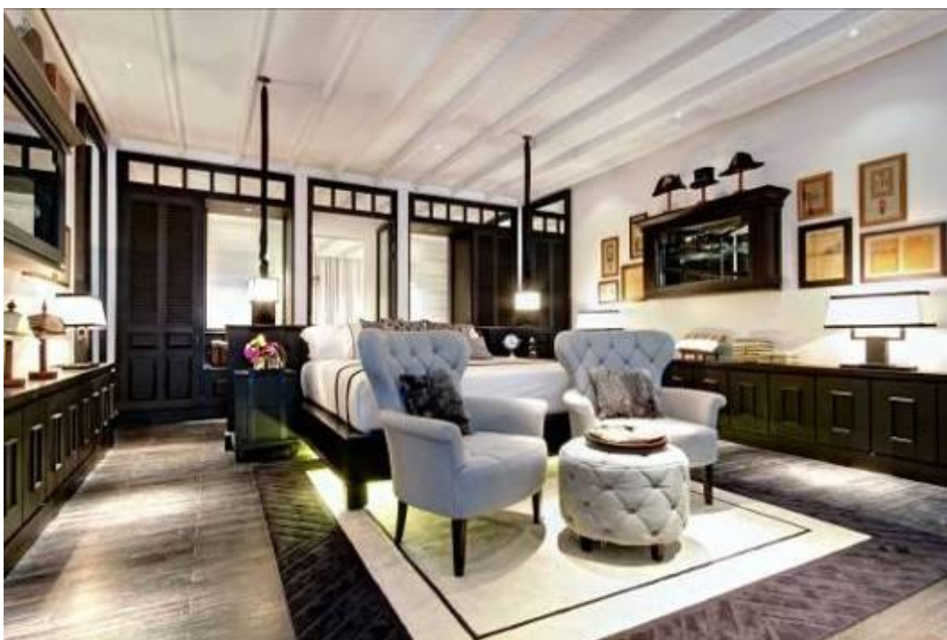
Siam Suite (standard room) bedroom