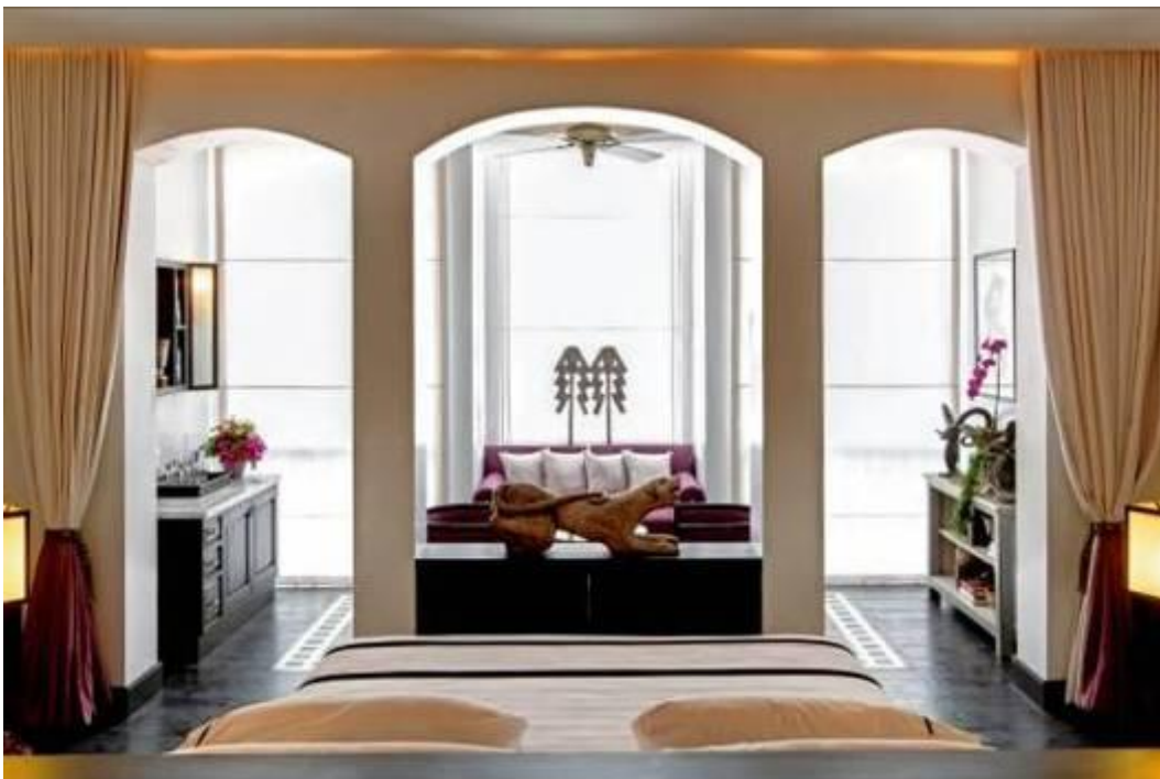
Maenam Suite (with river view) bedroom. All rooms are outfitted with super-sized king beds, lofty ceilings, art deco-style living rooms, airy bathrooms with deep soaking tubs and walk-in showers.