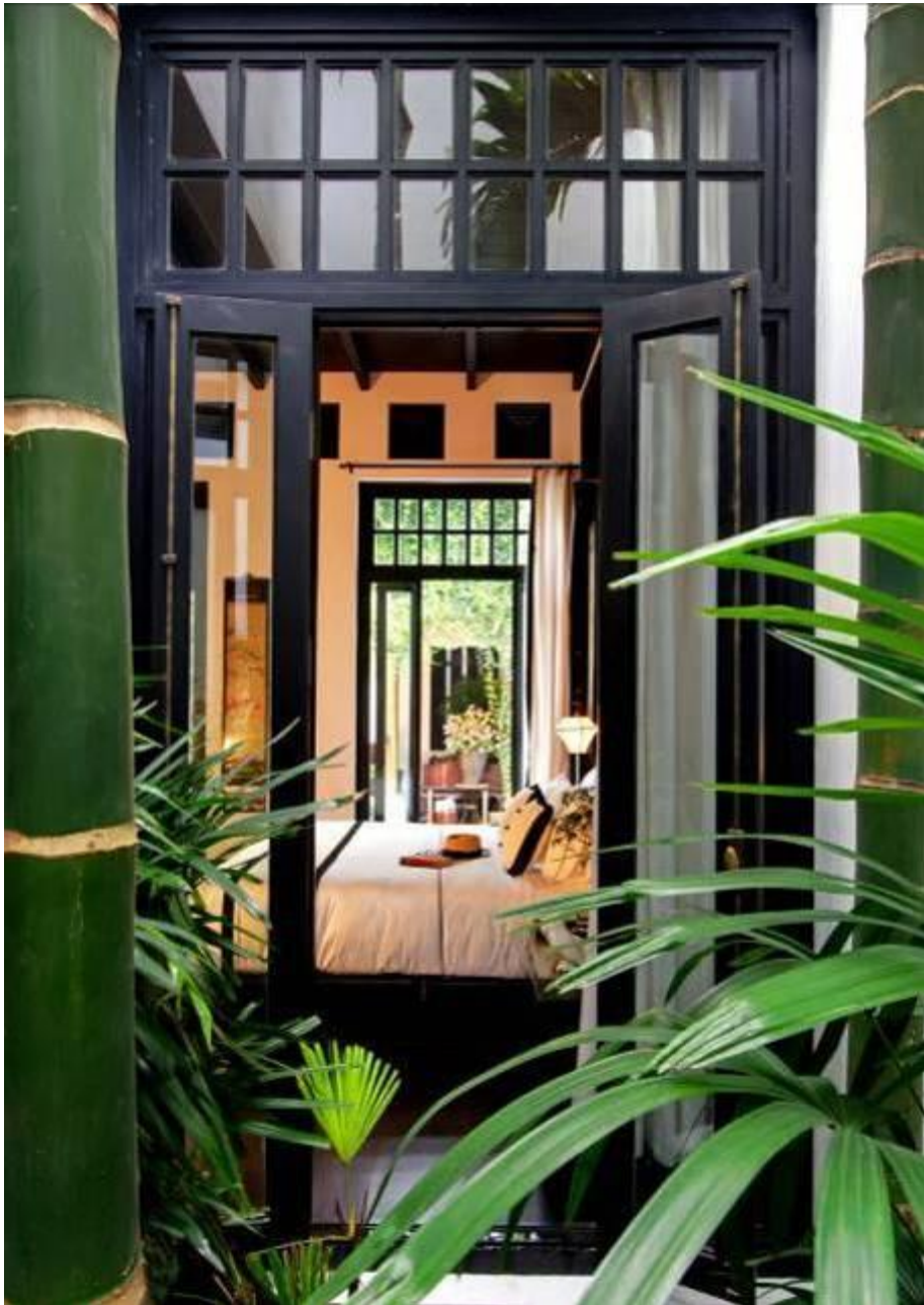
Chinese Villa bedroom