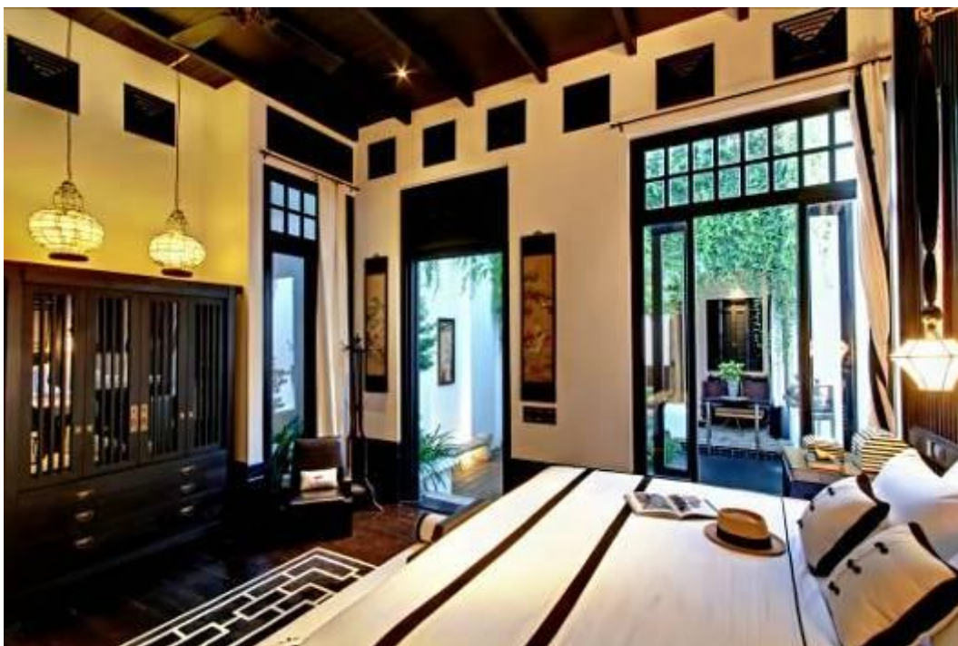
Chinese Villa bedroom