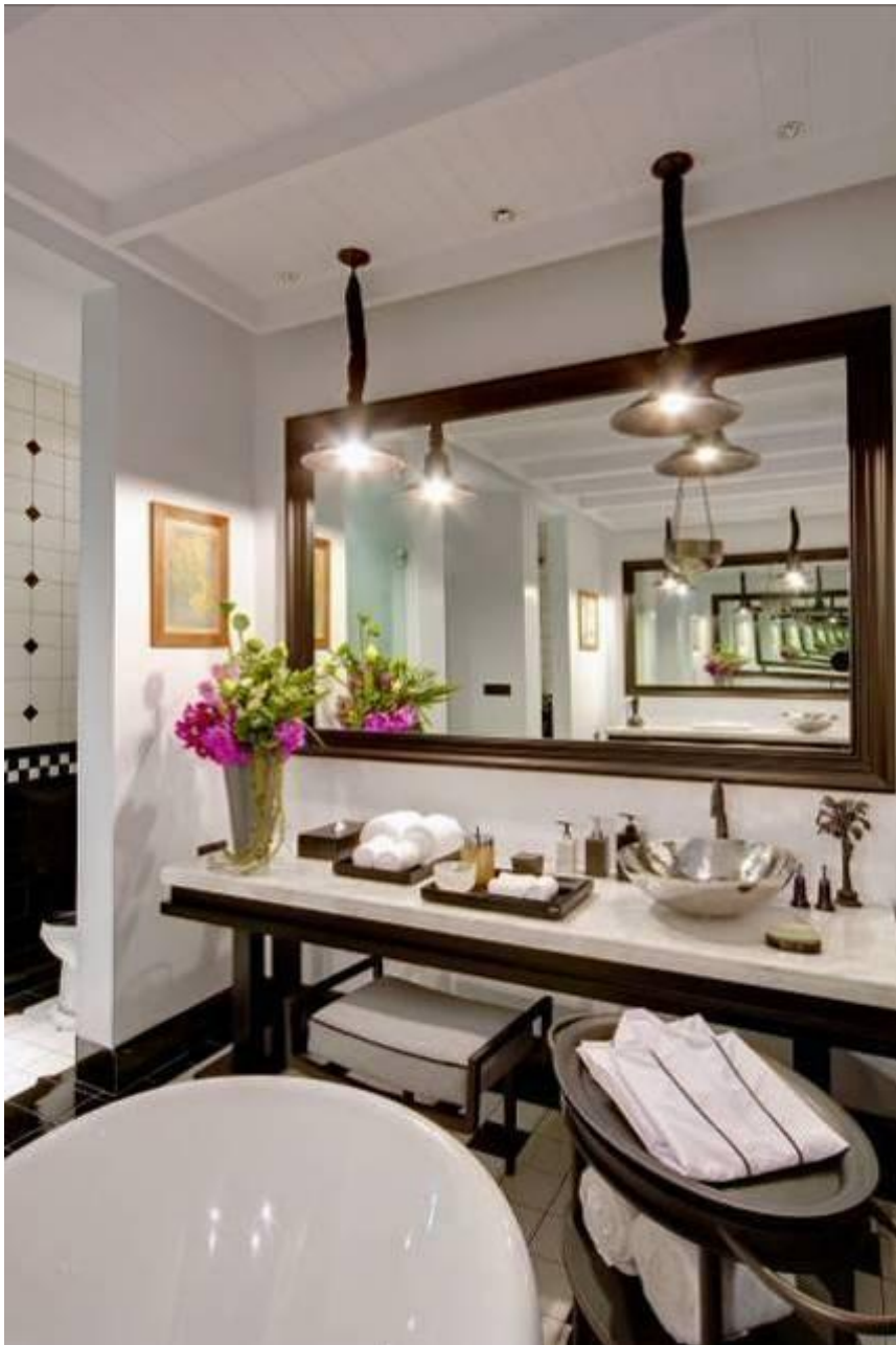
Siam Suite (standard room) bathroom