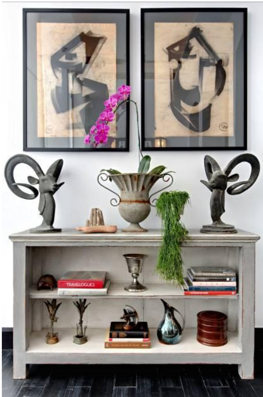
Maenam Suite detail