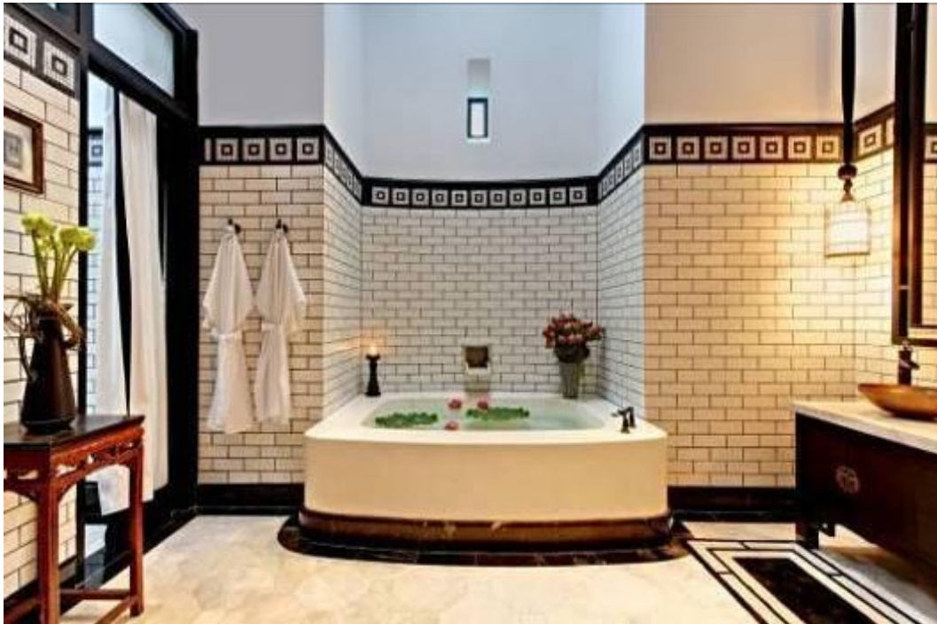
Chinese Villa bathroom