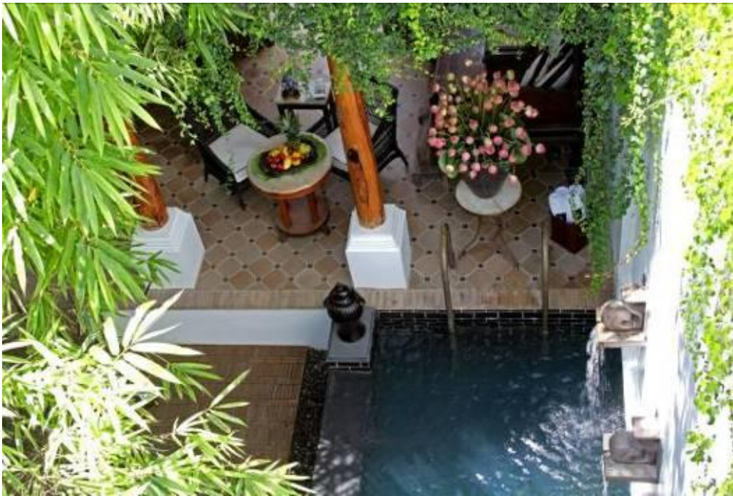
Chinese Villa pool