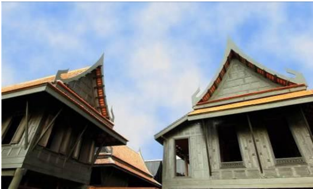
Three Thai houses form together to make Chon, The Siam's signature Thai restaurant and cooking school.