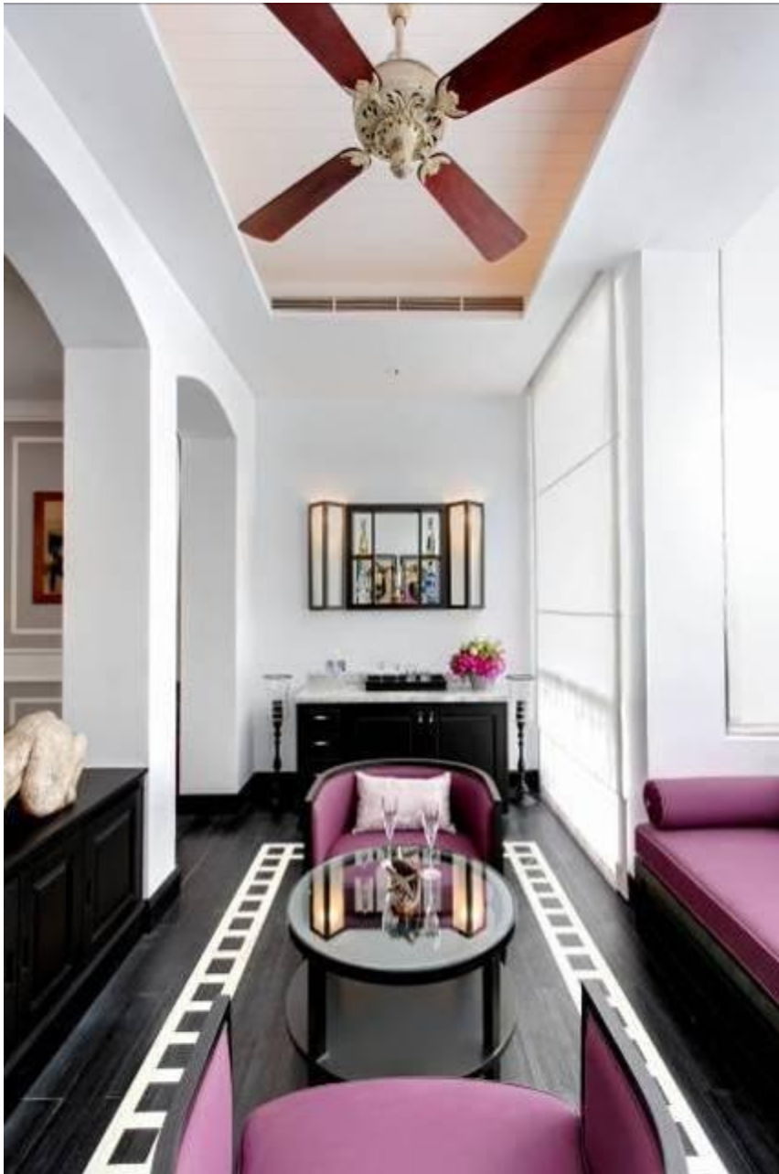
Maenam Suite living area. The architecture of the main residence draws inspiration from Paris Musée d'Orsay through its white wood and glass façade which provides plenty of light.