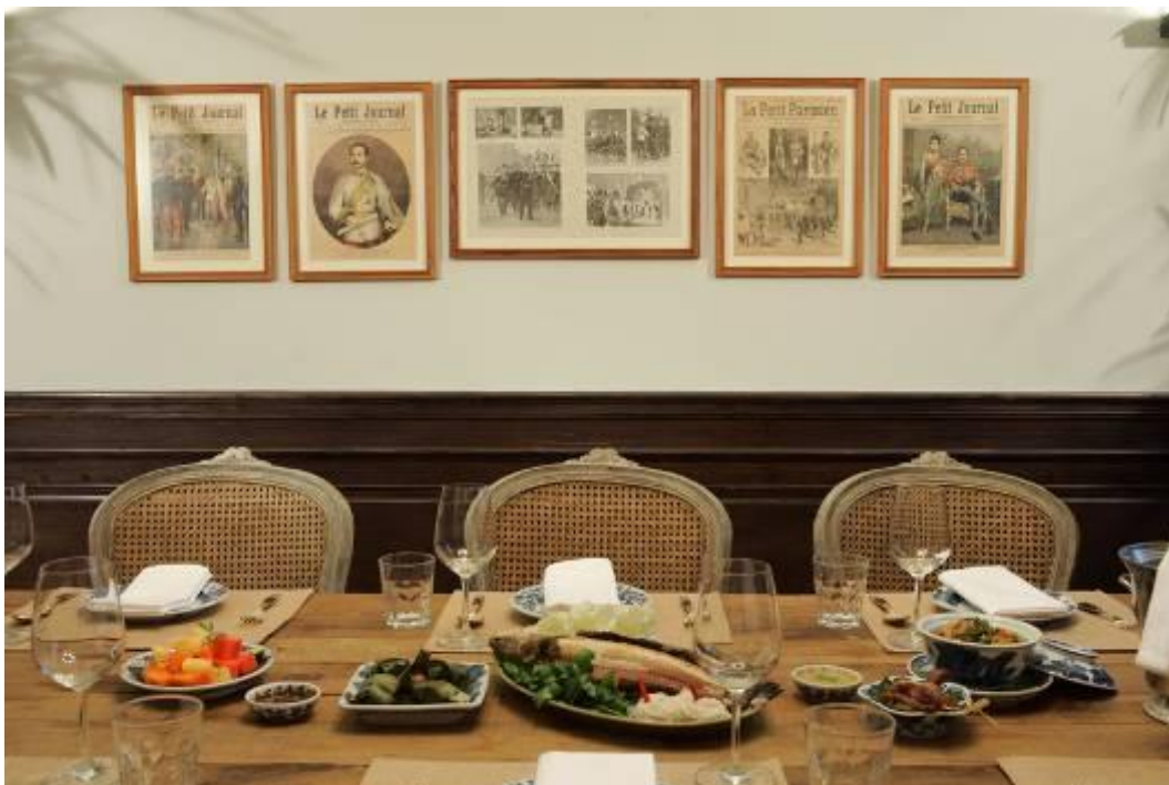
Restaurant Thai Lao Yeh across the lobby serves up authentic Thai and Laotian flavors in an old-world Oriental setting. The interior includes panels fashioned from century-old timber that was salvaged from a Thai village.