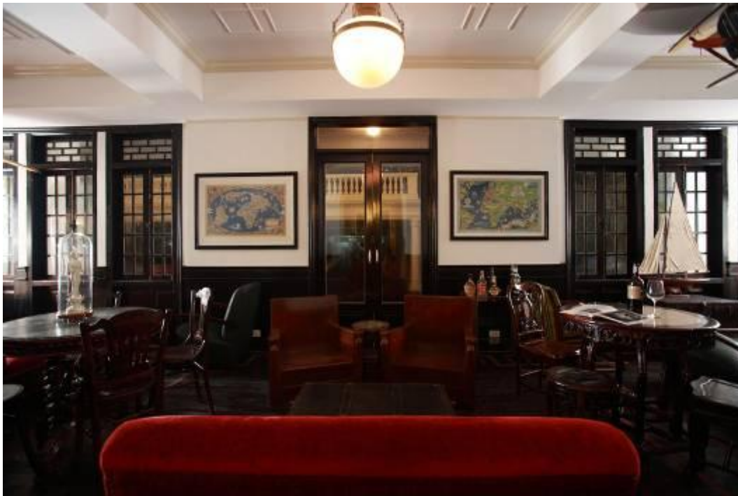
The Joy Luck Club on the ground floor, which is fitted out with antique furniture and memorabilia from around the world, including French museum cabinets, travel trunks, and classic model airplanes and ships.