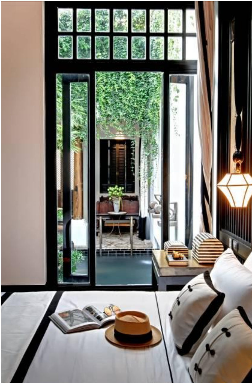
Chinese Villa bedroom. The hotel was designed by internationally acclaimed architect Bill Bensley, who gave the interior an art deco inspired look.