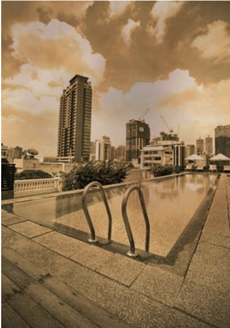
The hotel's rooftop garden has a 22-meter-long swimming pool.