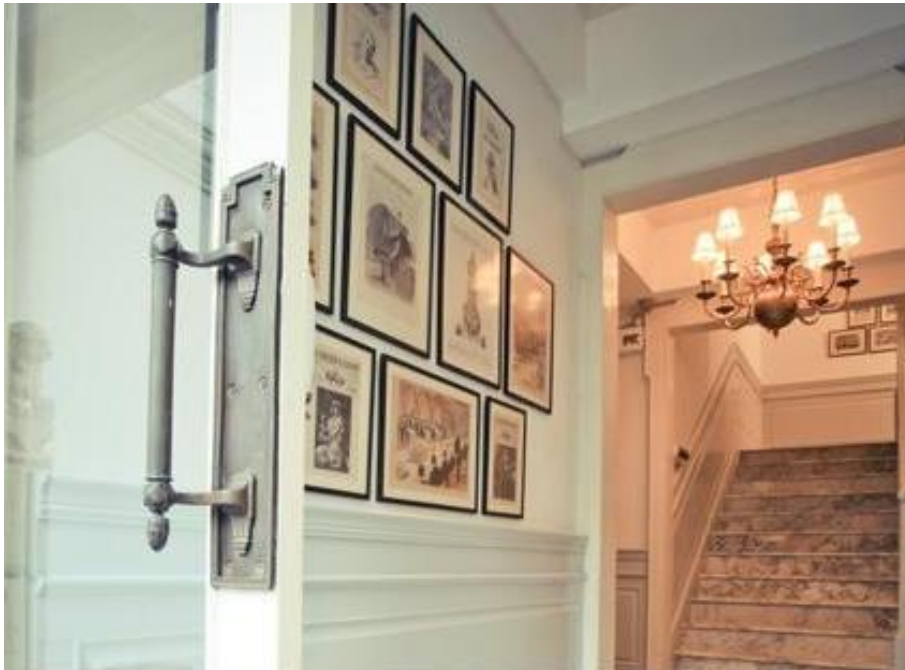
Staircase leading to the 2 nd floor.