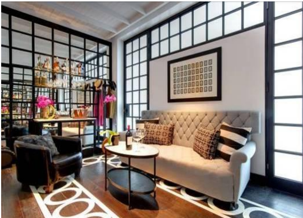
Siam Suite (standard room) living area