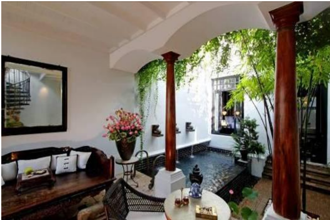
Chinese Villa entrance area.