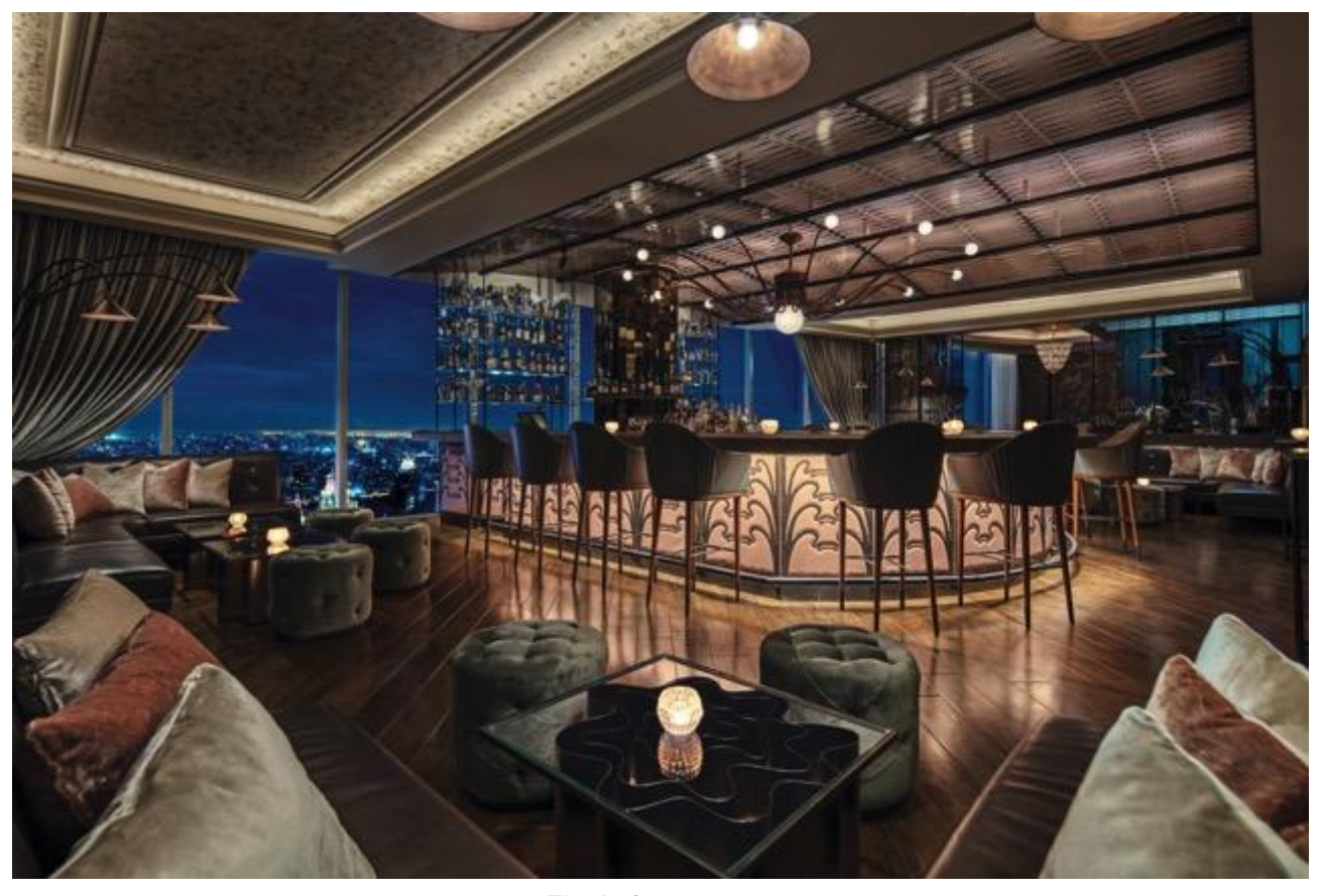
The Loft restaurant