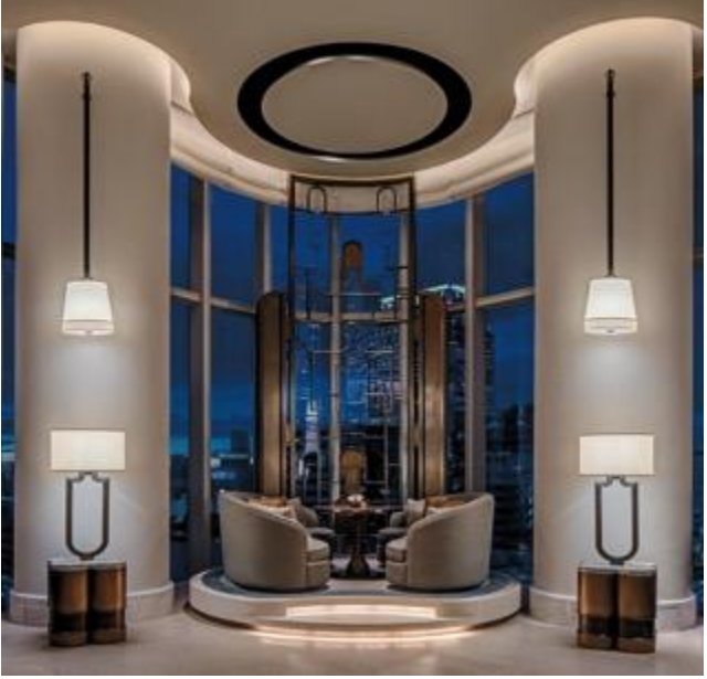
The Peacock Alley lounge serves as an area for guests to sit back and relax as well as provides a tranquil first impression upon arrival. The design of the lounge is characterized by heavy bronze and bright colors.