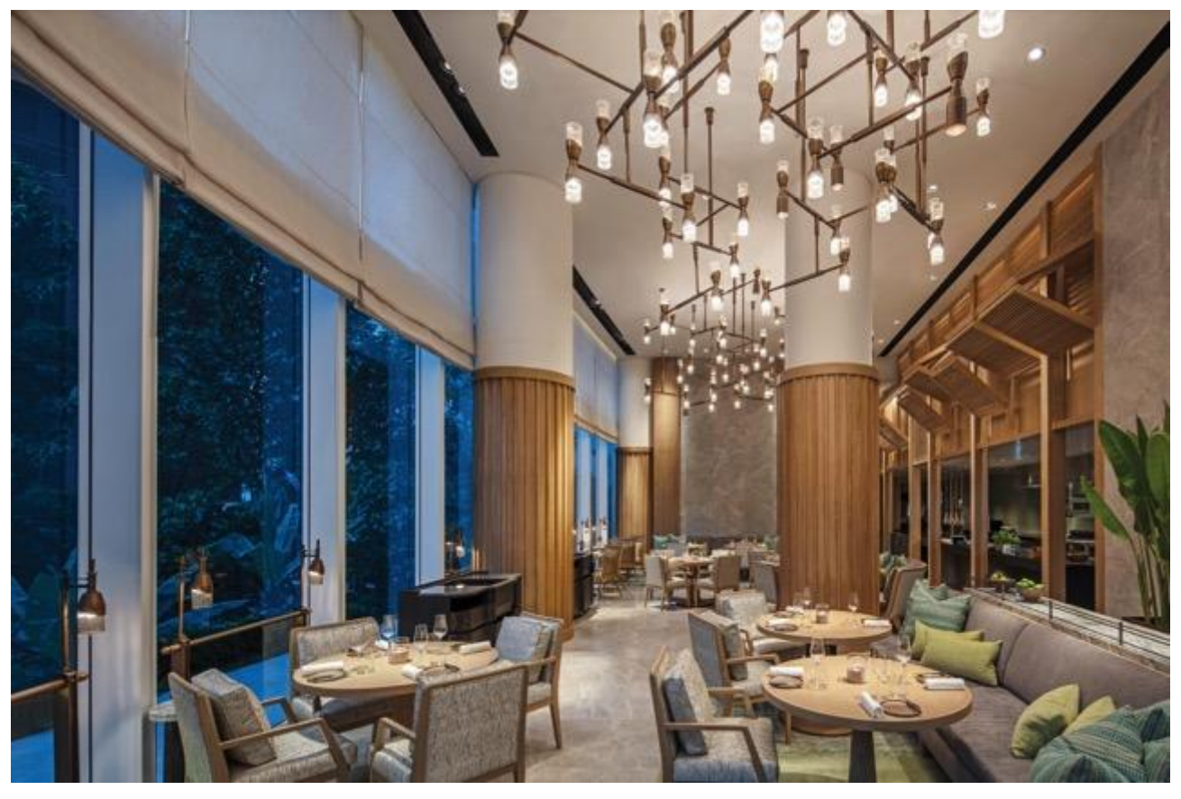
Front room dining area