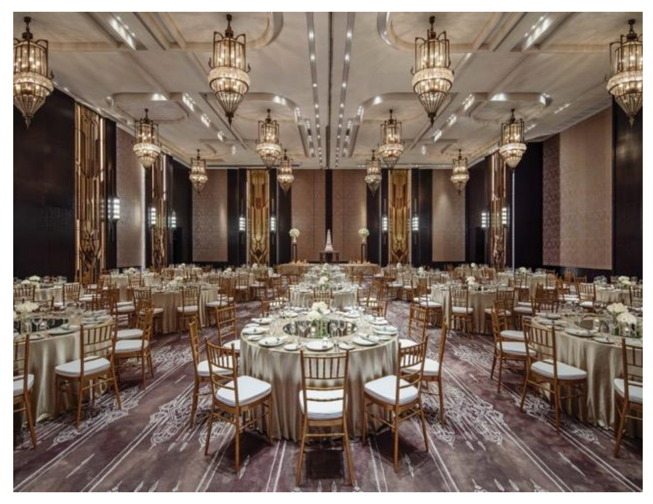
Meeting & event facilities with wedding round table