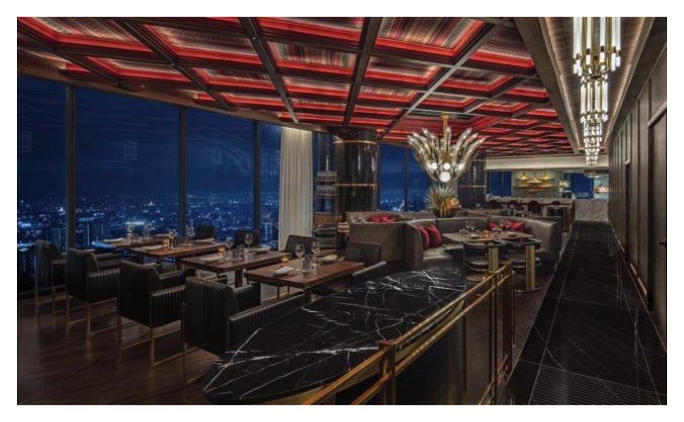
Dining area at Bull&Bear rooftop restaurant