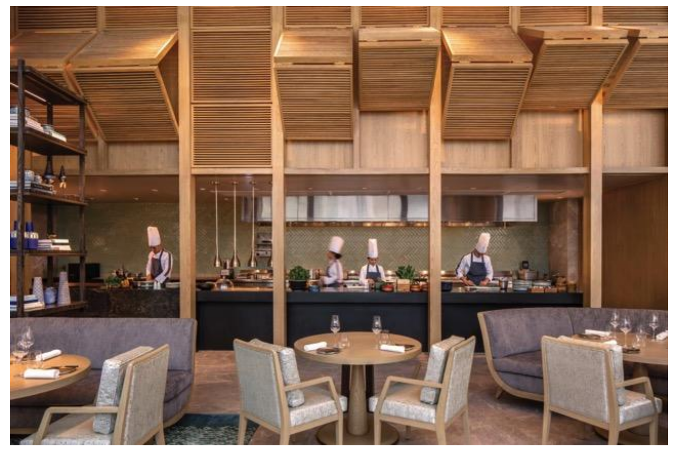
The open kitchen at the Front Room restaurant